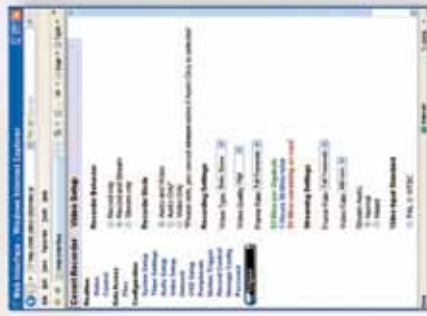
Example web page configuration screen