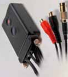
FlashBack-3 Single fitted with example cable clamp assembly

FlashBack-3 is available with an internal battery option that can power the unit for up to 1½ hours. Further options include internal motion detection with 16 user configurable zones.