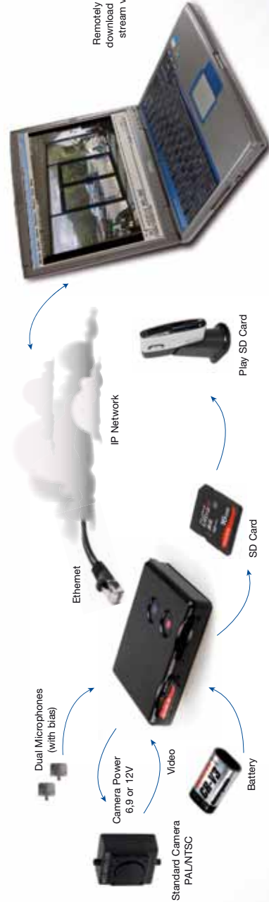
Remotely configure unit, download recordings and stream video to a PC