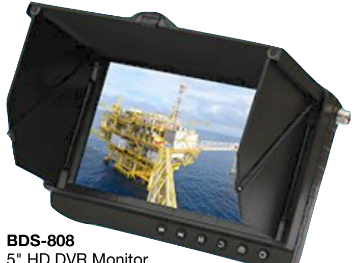
5" HD DVR Monitor w/ Screen Protector