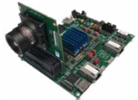
MVDK with MIPI CSI-2 Receiver interface board

The MIPI CSI-2 Receiver IP Core is delivered as encrypted VHDL. It is optionally available as VHDL source code. It is compatible with Xilinx Artix7, Kintex7, Zynq7 and Ultrascale+ FPGAs. The MIPI CSI-2 Receiver IP Software library is delivered as an object file. It is optionally available as C source code.