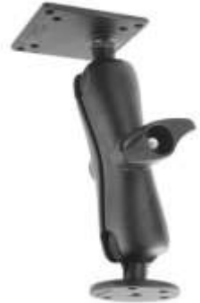
RAM-D-101U-246 RAM MOUNT WITH VESA PLATE