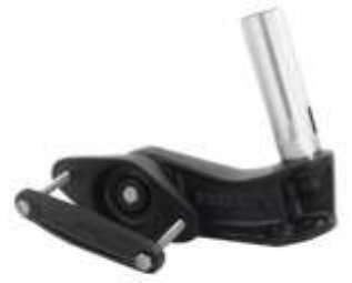
RAM-D-247U-4P1 4" FORK LIFT BASE WITH 1" POST RATCHET