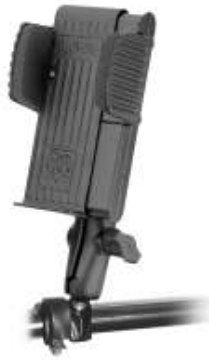
RAM-B-120-108B RAM HAND HELD HOLDER WITH V BASE & STRAPS