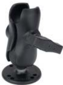
RAM-103U-B RAM MOUNT WITH 1 RAM-202 1/2" DIAMETER