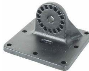
RAM-282U RAM 5" X 5" BASE WITH ADJUSTABLE FEATURE FEMALE TEETH