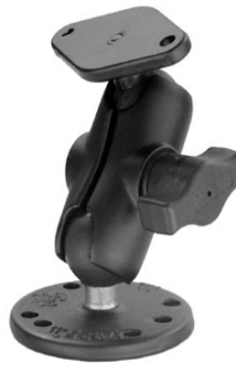
RAM-B-138U-A RAM MOUNT WITH 2.47 DIAMETER 2.47/1.31 BASE WITH A LENGTH ARM