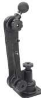
RAM-D-162H-MC4 RAM RATCHET SWING ARM WITH 2 1/4" BALL