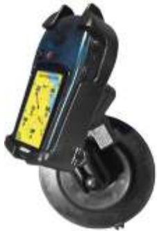
RAM-B-148-GA16U RAM SUCTION FOR THE GARMIN ETREX COLOR