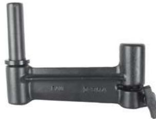
RAM-D-261-1U RAM EXTENSION SWING ARM FOR 1" PIPE