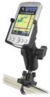
RAM-B-149Z-GA10 RAM RAIL MOUNT FOR THE GARMIN IQUE