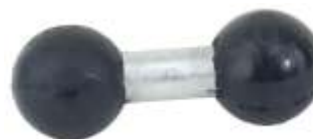
RAM-B-230 RAM DOUBLE 1" BALL ADAPTER