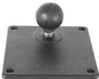
RAM-2461U RAM 3 5/8" SQ. 75 MIL. VESA BASE WITH BALL