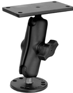
RAM-B-101-24U RAM MOUNT WITH 1 2" X 4" BASE & 1 STUD