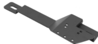
RAM-VB-114 VEHICLE BASE FOR THE 2002-NEWER TRAIL BLAZER & ENVOY