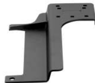
RAM-VB-158 VEHICLE BASE FOR THE 2005-NEWER JEEP WRANGLER