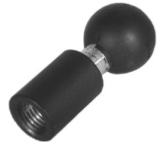
RAM-B-218-1 RAM SINGLE BALL WITH 1/4" NPT. HOLE