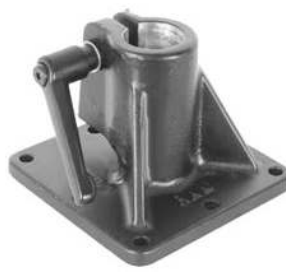
RAM-D-299U RAM 5" X 5" BASE WITH 1" PIPE FEMALE