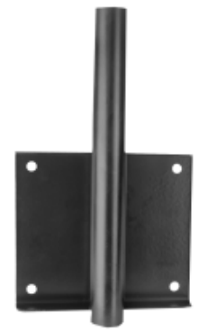
RAM-VBD-128 RAM UNIVERSAL DRILL TYPE FLAT VERTICAL BASE