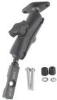
RAM-B-174-238U RAM GOLDWING WITH DIAMOND BASE