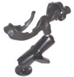
RAM-117 RAM-ROD FISHING ROD HOLDER SYSTEM