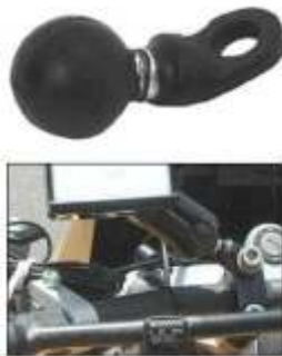
RAM-B-272U RAM BASE WITH 9 MM HOLE AND 1" BALL