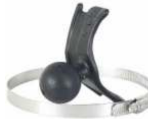
RAM-118B RAM SADDLE WITH BALL FOR LANTERNS