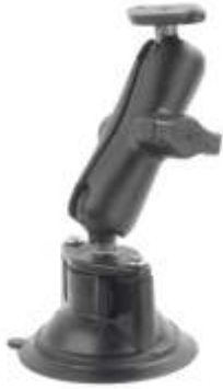
RAM-B-102-2241U RAM MOUNT WITH B-102 & 224-1