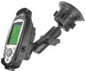
RAM-B-166-MA3 RAM SUCTION MOUNT FOR THE MAGELLAN SPORTRAK