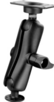
RAM-D-101U-243 RAM MOUNT WITH D-243, D-201 & D-254