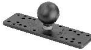
RAM-111B RAM MARINE ELETRONICS BASE 6 1/4" X 2"