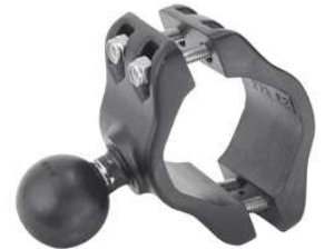
RAM-271U-2 RAM 2"- 2 1/2" DIAMETER RAIL BASE WITH BALL