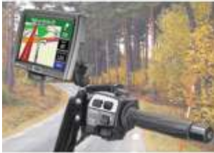
RAM-B-174-G3U RAM BRAKE/CLUTCH RESERVOIR FOR THE GARMIN 7200