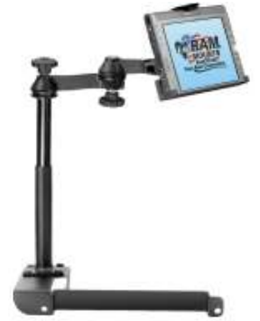
RAM-VB-148-SW1 VEHICLE SYSTEM FOR THE 2003- NEWER FORD FOCUS