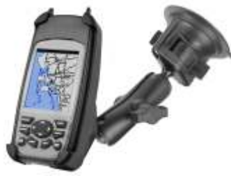
RAM-B-166-LO3 RAM SUCTION MOUNT FOR THE LOWRANCE IFINDER H2O & MAP