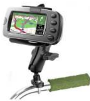
RAM-B-149Z-GA9 RAM RAIL MOUNT FOR THE GARMIN 2610