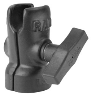
RAM-200-10FU RAM 1 1/2" SOCKET ARM WITHOUT OCTAGON FEMALE HOLE