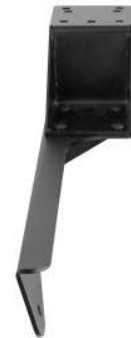
RAM-VB-145 VEHICLE BASE FOR THE 2006-NEWER CHRYSLER 300