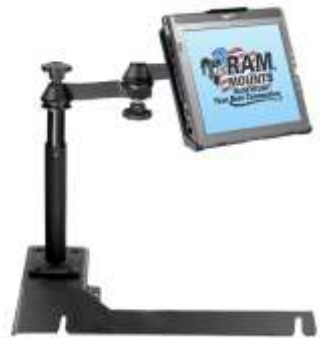
RAM-VB-111-MOT4 VEHICLE SYSTEM FOR THE 2000-NEWER IMPALA