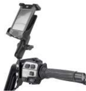
RAM-B-174-PD1 RAM BRAKE/CLUTCH RESERVOIR WITH UNIVERSAL PDA CRADLE