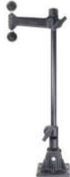
RAM-101U-VE3 RAM MOUNT VELOCITI