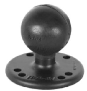
RAM-202 RAM 2-1/2" DIAMETER BASE