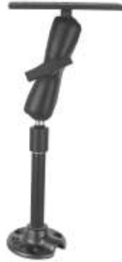
RAM-134-90 RAM 90 DEGREE BASE 6" PIPE DOUBLE SOCKET MOUNT