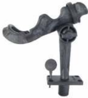
RAM-114-F RAM ROD 2000 ROD HOLDER WITH FLUSH MOUNT