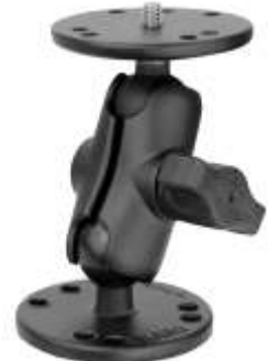
RAM-B-101AU RAM 1" MOUNT WITH 2 BASES 1 1/4-20 STUD BASE, 1 202 BASE