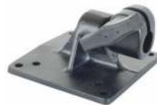
RAM-246HU VESA PLATE WITH 1/2" HOLE