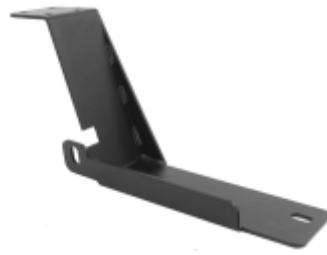
RAM-VB-112 VEHICLE BASE FOR THE 2002-NEWER EXPLORER