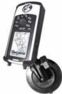
RAM-B-148-GA6 RAM SUCTION MOUNT FOR THE GARMIN GPS 76 SERIES