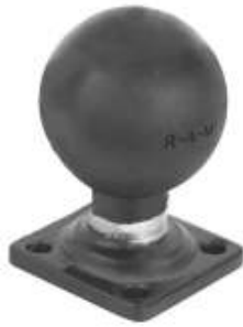
RAM-D-202U-22 RAM 2" X 2" BASE WITH BALL