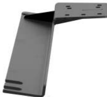
RAM-VB-156 VEHICLE BASE FOR THE 2005- NEWER KIA OPTIMA & HYUNDA