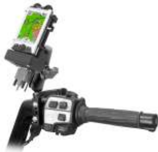
RAM-B-174-CO5P RAM BRAKE/CLUTCH RESERVOIR POWERED IPAQ FAMILY