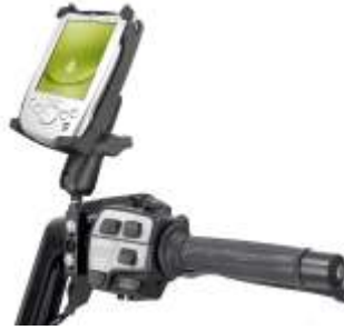
RAM-B-174-DE1 RAM BRAKE/CLUTCH RESERVOIR FOR THE DELLXIM X5