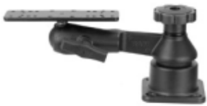
RAM-109HSB RAM SINGLE ARM BALL MOUNT WITH HORIZONTAL BASE