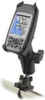
RAM-B-149Z-LO3 RAM U-BOLT MOUNT FOR THE LOWRANCE IFINDER H2O & MAP