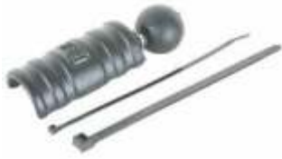
RAM-226 RAM UMBRELLA SADDLE