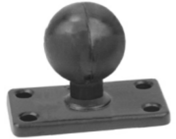
RAM-202U-153 RAM BASE 1.5" X 3" WITH 1 1/2" BALL