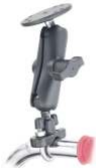
RAM-B-149Z-202U RAM U-BOLT MOUNT WITH 202 BASE