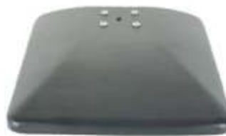
RAM-251-1SA RAM 9" X 9" ALUMINUM BASE WITH 4 HOLES