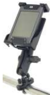
RAM-B-149Z-PD1 RAM RAIL MOUNT WITH UNIVERSAL PDA CRADLE