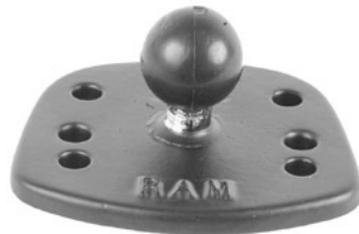
RAM-B-107-1B RAM BASE FOR CUDA PIRANHA