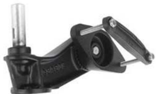
RAM-247U-4P1 FORK LIFT BASE WITH 1/2" POST, 4" CLAMP