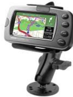
RAM-B-138-GA9 RAM MOUNT FOR GARMIN STREETPILOT SERIES