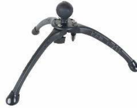
RAM-205U TRI-POD WITH BALL