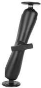
RAM-101U-D RAM MOUNT WITH 2 2 1/2" BASES & D