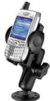
RAM-B-138-UN1 RAM UNIVERSAL MOUNT FOR SMALL SIZE DEVICES