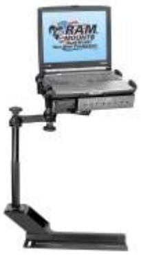
RAM-VB-106R4-SW1 VEHICLE SYSTEM FOR THE DODGE SPRINTER VAN