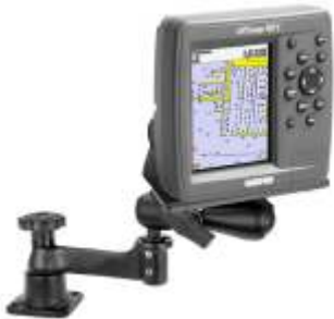
RAM-109H-2 RAM HORIZONTAL SWING ARM WITH RAM BALL SYSTEM