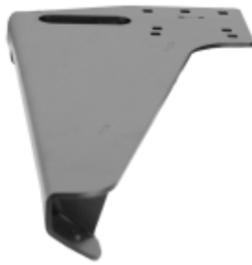
RAM-VB-152 VEHICLE BASE FOR THE 2000- NEWER FORD ESCAPE