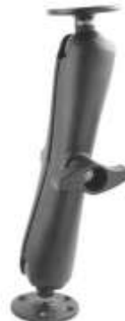
RAM-D-101U-C-HY1 RAM MOUNT SHORT WITH 2" RAIL & 2" PLATE