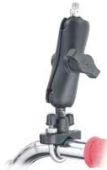
RAM-B-149Z-237U RAM RAIL MOUNT WITH 1/4"-20 MALE