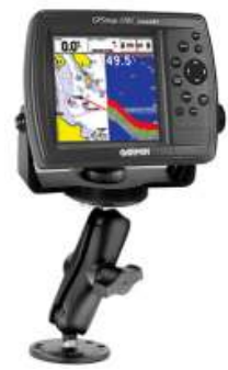
RAM-101-G2 RAM MOUNT GARMIN 250C FISH FINDER