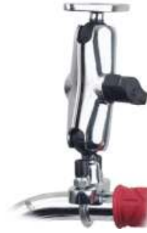
RAM-B-149CHU RAM U-BOLT MOUNT WITH CHROME