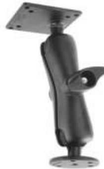
RAM-D-101-ID1U RAM MOUNT WITH 1-3.68 BASE & VESA BASE