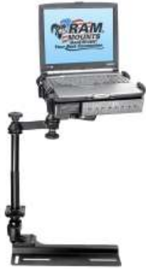
RAM-VB-147-SW1 VEHICLE SYSTEM FOR THE 2006- NEWER DODGE STRATUS