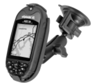
RAM-B-166-MA6 RAM SUCTION MOUNT FOR THE MAGELLAN EXPLORIST XL