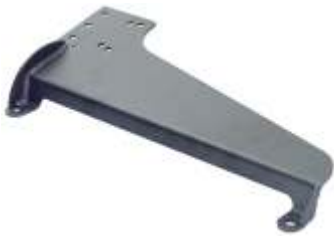
RAM-VB-137 VEHICLE BASE 2006 - TOYOTA CAMRY