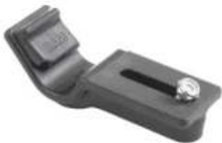
RAM-234KU RAM UNIVERSAL LAPTOP TRAY SIDE KEEPER