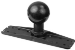
RAM-E-111BU RAM BASE 11" X 3" WITH 3 3/8" BALL