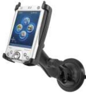
RAM-B-166-CO3 RAM SUCTION MOUNT FOR THE HP IPAQ 2000 SERIES