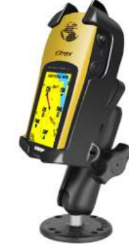
RAM-B-138-GA16 RAM MOUNT FOR GARMIN COLOR ETREX