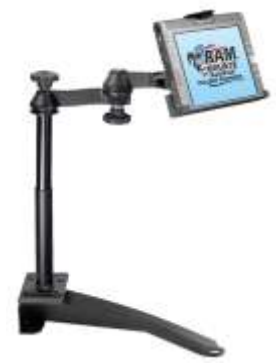
RAM-VB-142-MOT3 VEHICLE SYSTEM FOR THE 2005- NEWER GRAND CHEROKEE