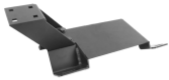
RAM-VB-110 VEHICLE BASE FOR THE 1997-03 EXPEDITION & F150