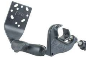
RAM-B-125U UNPKD RAM YOKE MOUNT WITH ANGLED PLATE