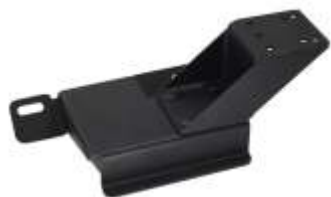
RAM-VB-113 VEHICLE BASE FOR THE 1994-NEWER