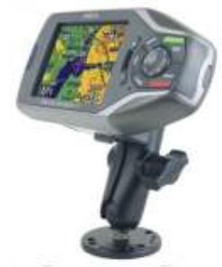
RAM-B-101-MA4 RAM MOUNT MAGELLAN ROADMATE