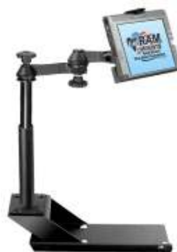
RAM-VB-116-MOT3 VEHICLE SYSTEM FOR THE 2004-NEWER COLORADO