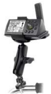
RAM-B-149Z-GA2 RAM U-BOLT MOUNT FOR THE GARMIN GPS II & III