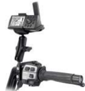
RAM-B-174-GA2 RAM BRAKE/CLUTCH RESERVOIR FOR THE GARMIN 2, 3 & 5