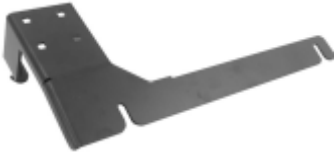
RAM-VB-111 VEHICLE BASE FOR THE 2000-NEWER IMPALA