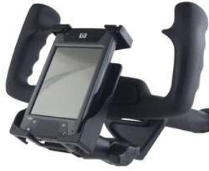
RAM-B-121-PD1U RAM UNIVERSAL PDA CRADLE / YOKE CLAMP