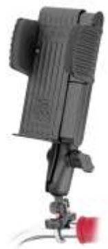
RAM-B-120-231 RAM HAND HELD MOUNT WITH U-BOLT RAIL CLAMP