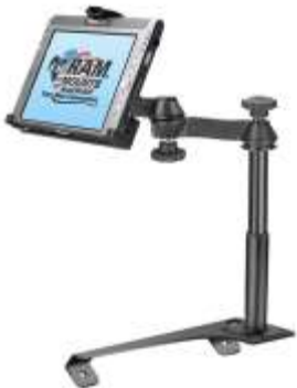
RAM-VB-166-MOT3 VEHICLE SYSTEM FOR THE 2006- NEWER FORD EXPEDITION