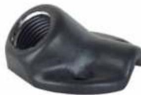
RAM-232-45 RAM 2 1/2" DIAMETER BASE WITH 1/2" NPT HOLE 45 DEGREE