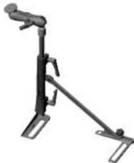
RAM-160-1U RAM SEAT RAIL SYSTEM WITH 1 SWING ARM & BALL