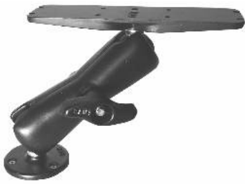
RAM-D-111U RAM MOUNT WITH 3" X 11" BASE & 3/4" BASE