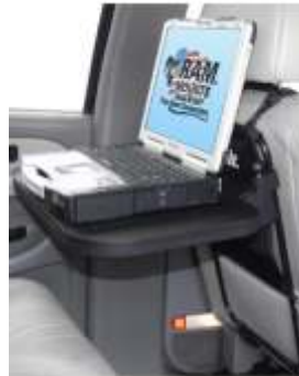
RAM-234-4 RAM REAR SEAT LAPTOP MOUNT