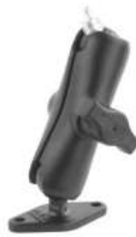
RAM-B-102-237U RAM MOUNT WITH B-238, B-201 & B-237