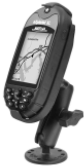
RAM-B-138-MA6 RAM MOUNT FOR THE MAGELLAN EXPLORIST XL