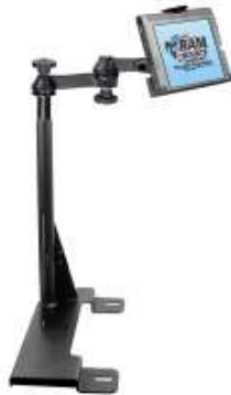
RAM-VB-119-MOT3 VEHICLE SYSTEM FOR THE 1995- NEWER ECONOLINE VAN