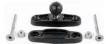
RAM-B-247U-3 RAM CLAMP BASE WITH BALL 3" MAX WIDTH