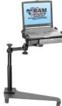
RAM-VB-153-SW1 VEHICLE SYSTEM FOR THE 2005- NEWER TOYOTA SIENNA