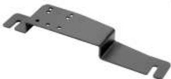
RAM-VB-161 VEHICLE BASE FOR THE 2006-NEWER FORD 500 & FREESTYLE