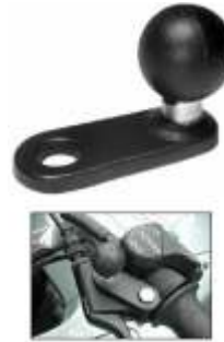
RAM-B-252U RAM .87 X 2.25 WITH 11 MM HOLE & 1" BALL