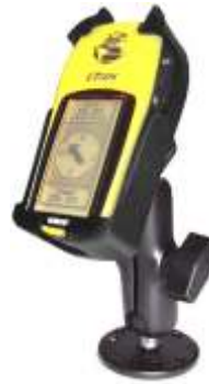
RAM-B-138-GA5 RAM MOUNT FOR GARMIN E-TREX