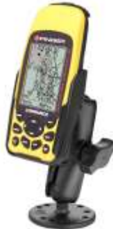
RAM-B-138-LO2 RAM MOUNT FOR THE LOWRANCE IFINDER ATLANTIS AND PRO