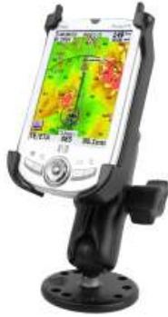
RAM-B-138-CO4 RAM MOUNT FOR HP IPAQ 1900, 4100 SERIES