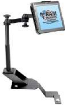
RAM-VB-101-MOT4 VEHICLE SYSTEM FOR THE 1995-NEWER SONOMA BLAZER & S10