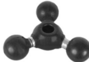
RAM-289U RAM TRIPLE BALL BASE 120 DEGREE APART