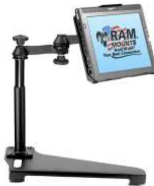
RAM-VB-152-MOT4 VEHICLE SYSTEM FOR THE 2000- NEWER FORD ESCAPE