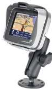
RAM-B-138-TO2 RAM MOUNT FOR THE TOMTOM RIDER