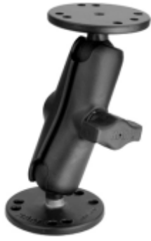
RAM-B-101 RAM MOUNT WITH 2 RAM-B-202 BASES