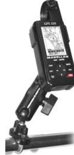
RAM-B-149Z-MA1 RAM U-BOLT MOUNT FOR THE MAGELLAN 12, 300 & 315