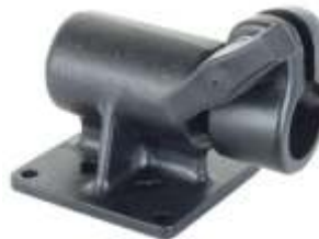
RAM-D-246-1HU RAM VESA 75MM WITH 1" PIPE HOLE