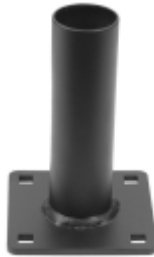
RAM-VP-TBF5U RAM TELE-POLE BASE FEMALE 5" LONG