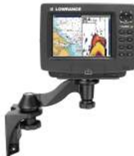
RAM-109V RAM SINGLE SWING ARM MOUNT SYSTEM WITH VERTICAL BASE