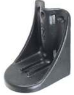
RAM-D-162VU RAM VERTICAL/POLE RATCHET SWING ARM BASE