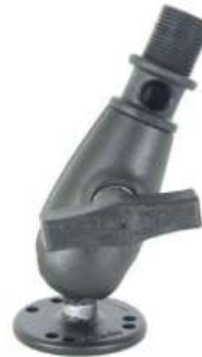
RAM-112 RAM ANTENNA MOUNT WITH 1"-14 MALE POST