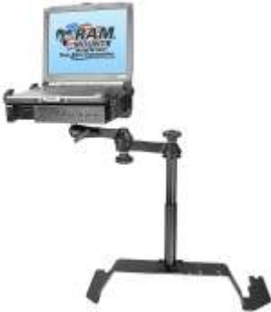
RAM-VB-103-SW1 VEHICLE SYSTEM FOR THE 1500, 2500, 3500 SILVERADO