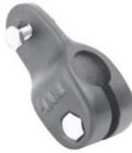
RAM-264U RAM TRI & BI-POD LEG CONNECTOR 1/2 PIPE