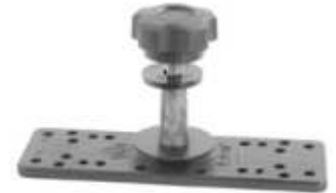
RAM-111BTU RAM BASE 6.25 X 2 TAPPED FOR SWING