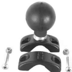
RAM-D-271U-12 RAM 1 1/4"-1 7/8" DIAMETER RAIL BASE WITH BALL