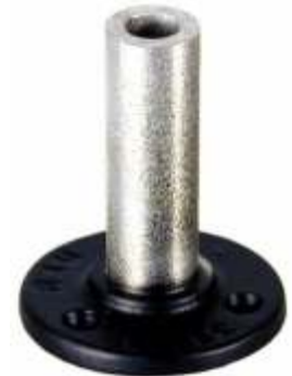
RAM-316-TU RAM POD III 1/2" PIPE POST