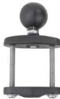
RAM-247U-15 RAM CLAMP BASE WITH BALL 1.5" MAX WIDTH