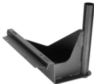
RAM-VB-140 VEHICLE BASE NATIONAL SEATING