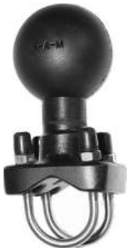
RAM-D-235U RAM WITH 2 U-BOLTS FOR 3/4 TO 1 1/4