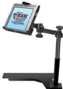
RAM-VB-157-MOT3 VEHICLE SYSTEM FOR THE 2006-NEWER CHEVY MALIBU