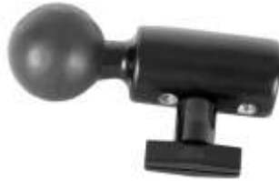
RAM-215 RAM BALL WITH 5/8" HEXAGON HOLE FOR PHOTO