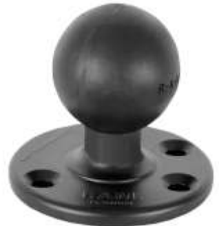
RAM-D-202U RAM 3.68" DIAMETER BASE