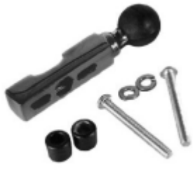
RAM-B-309-1 RAM MOTORCYCLE HANDLEBAR BASE WITH 1 BALL