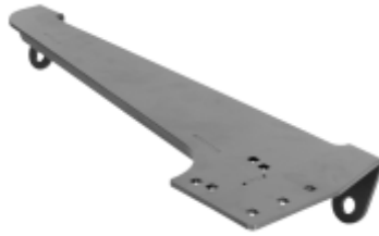
RAM-VB-133 VEHICLE BASE FOR THE 2006- NEWER TOYOTA TUNDRA