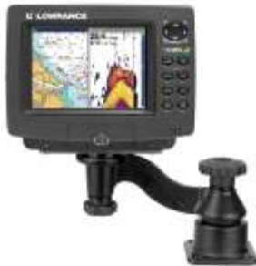
RAM-109H RAM SINGLE SWING ARM MOUNT SYSTEM HORIZONTAL BASE