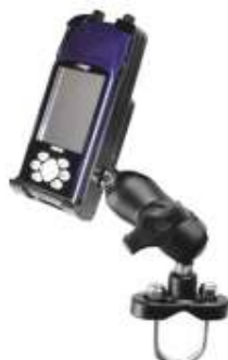
RAM-B-149ZA-GA4 RAM U-BOLT MOUNT WITH A ARM FOR THE GARMIN E-MAP