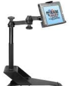
RAM-VB-138-MOT3 VEHICLE SYSTEM FOR THE 2006- NEWER TOYOTA 4-RUNNER