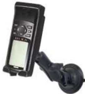
RAM-B-166-GA1 RAM SUCTION MOUNT FOR THE GARMIN GPS 12 SERIES