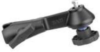
RAM-VB-109-2U RAM SWING ARM WITH SOCKET