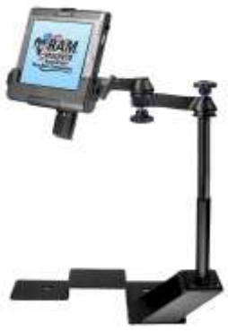
RAM-VB-109-MOT1 VEHICLE SYSTEM FOR THE 2004-NEWER F150