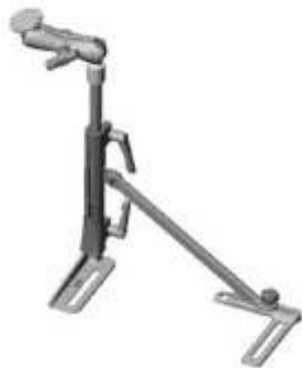
RAM-160BU RAM SEAT RAIL SYSTEM WITH 18"