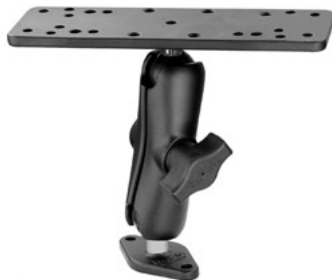
RAM-B-111-238U RAM 6 1/4" BASE MOUNT WITH B-238