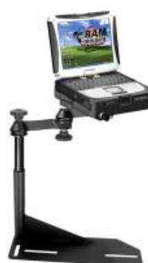
RAM-VB-117-PAN2 VEHICLE SYSTEM TOUGH DOCK CF-18