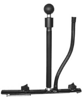
RAM-B-131 RAM AIRCRAFT SEAT RAIL BASE WITH MOUNT