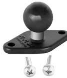
RAM-B-202-MA4 RAM BASE FOR THE MAGELLAN ROADMATE