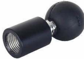
RAM-218-1 RAM SINGLE BALL WITH 1/2" NPT HOLE