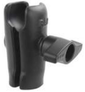
RAM-D-200-10FU RAM 2 1/4" S SOCKET ARM WITHOUT OCTAGON FEMALE