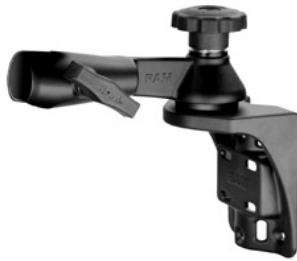
RAM-109VS-4U RAM STRAIT SWING ARM WITH VERTICAL BASE