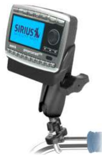
RAM-B-149Z-XM1 RAM RAIL MOUNT FOR XM SATELLITE RADIOS