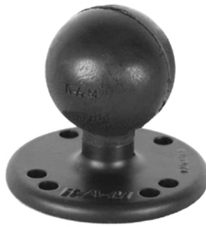
RAM-202U-MT1 RAM 2-1/2" DIAMETER BASE 5/16"-18 HOLE