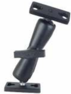
RAM-151 RAM MOUNT FOR BOSCH RAIL STRUCTURES