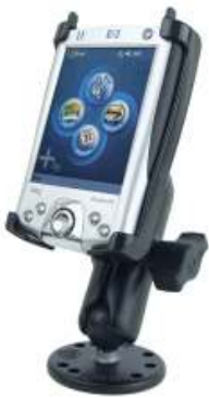
RAM-B-138-CO3 RAM MOUNT FOR HP IPAQ 2000 SERIES