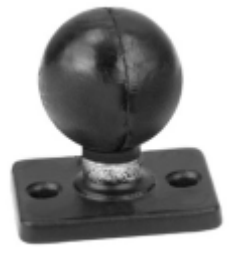
RAM-202U-12 RAM BASE 1" X 2" WITH 1 1/2" BALL