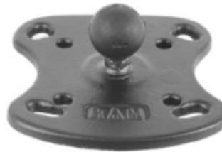
RAM-B-107B RAM 1" BASE FOR HUMMINBIRD & APELCO 97