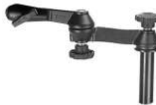
RAM-VP-TTM8-1U RAM TELE-POLE BASE MALE POST & ARM