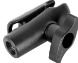
RAM-D-200-1 RAM SINGLE SOCKET ARM WITH 1" NPT HOLE