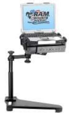
RAM-VB-152-SW1 VEHICLE SYSTEM FOR THE 2000- NEWER FORD ESCAPE