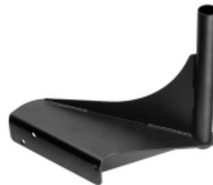
RAM-VB-151 VEHICLE BASE SEATS INC.