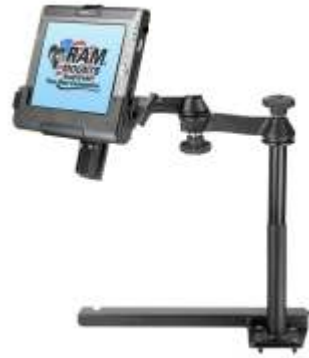
RAM-VB-149-SW1 VEHICLE SYSTEM FOR THE 2005- NEWER TOYOTA HIGHLANDER