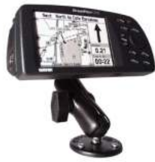
RAM-B-145 RAM MOUNT FOR GARMIN STREETPILOT