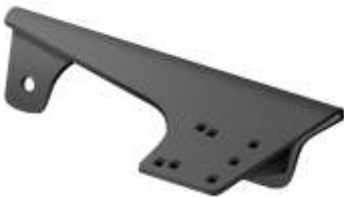
RAM-VB-165 VEHICLE BASE FOR THE 2006-NEWER HUMMER H3