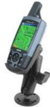
RAM-B-138-GA12 RAM MOUNT FOR GARMIN 60 SERIES