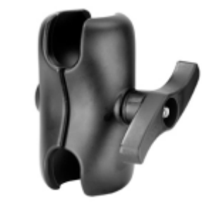
RAM-E-201U-D RAM DOUBLE SOCKET D SHORT ARM