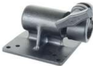
RAM-D-246HU VESA BRACKET WITH 1" HOLE