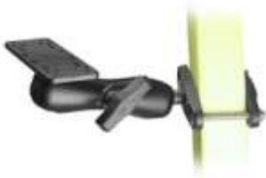
RAM-111-247U-2 RAM MOUNT 111B, 2" SQUARE TUBE BASE