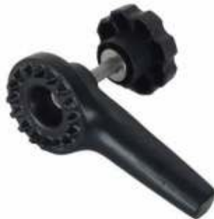
RAM-281U RAM POST WITH MALE TEETH FOR ADJ BASE