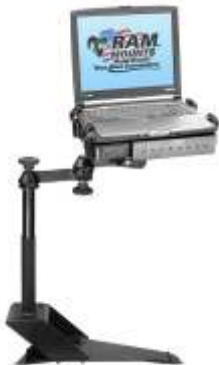
RAM-VB-138-SW1 VEHICLE SYSTEM FOR THE 2006- NEWER TOYOTA 4-RUNNER