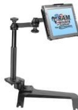
RAM-VB-159-MOT4 VEHICLE SYSTEM FOR THE 2007 CHEVY TAHOE