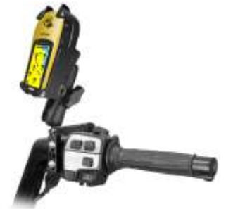
RAM-B-174-GA16 RAM BRAKE/CLUTCH RESERVOIR FOR THE GARMIN ETRIX COLOR