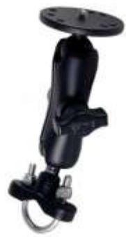
RAM-B-149Z-C1 RAM VIDEO CAMERA MOUNT FOR RAILS & BARS