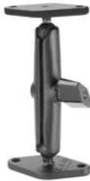
RAM-A-101U-B RAM SYSTEM WITH 9/16" BALLS LONG ARM