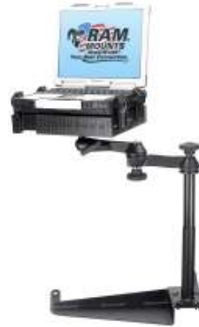
RAM-VB-134-SW1 VEHICLE SYSTEM FOR THE 2006- NEWER NISSAN TITAN