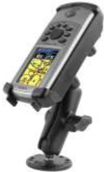
RAM-B-138-GA14 RAM MOUNT FOR GARMIN GPS 76C & 76CS SERIES