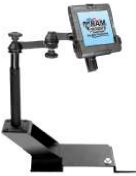
RAM-VB-110-MOT1 VEHICLE SYSTEM FOR THE 1997-03 EXPEDITION & F150