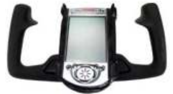
RAM-B-121-CO1 RAM YOKE MOUNT FOR HP IPAQ