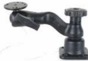
RAM-109H-3BU RAM BENT SWING ARM WITH HORIZONTAL BASE & BALL