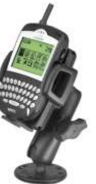
RAM-B-138-UN3 RAM UNIVERSAL MOUNT FOR MEDIUM SIZE DEVICES