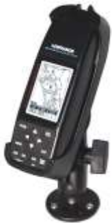
RAM-B-138-LO1 RAM MOUNT FOR THE LOWRANCE GLOBALMAP AND AIRMAP SERIES