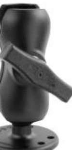
RAM-103-BU RAM SHORT ARM WITH 202