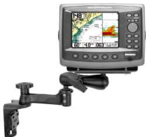
RAM-109V-2 RAM SWING ARM WITH RAM BALL SYSTEM AND VERTICAL BASE