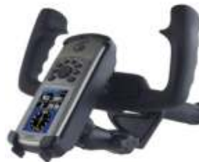
RAM-B-121-GA14 RAM YOKE MOUNT FOR 76C SERIES