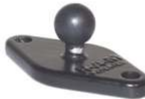
RAM-A-238 RAM 2 7/16" X 1 5/16" BASE WITH BALL