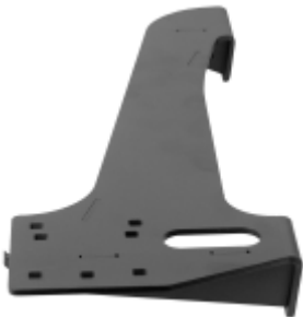
RAM-VB-135MH1 VEHICLE BASE FOR THE 2006-NEWER HONDA ELEMENT