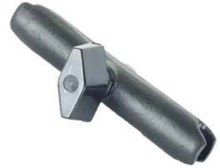
RAM-A-201U-B RAM DOUBLE SOCKET EXTRA LONG ARM