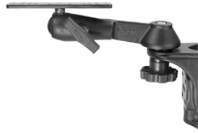
RAM-109VSB RAM SINGLE ARM BALL MOUNT WITH VERTICAL BASE