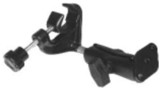
RAM-B-121-238 YOKE CLAMP MOUNT WITH B-238 BASE