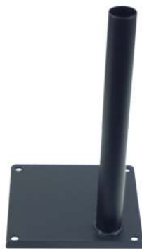
RAM-VBD-125 VEHICLE BASE CHEVY PICKUP