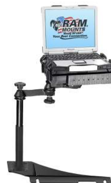
RAM-VB-160-SW1 VEHICLE SYSTEM FOR THE 2006-NEWER CHEVY IMPALA