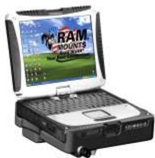
RAM-234-PAN2M RAM PANASONIC LAPTOP MOUNT CF-18 TOUGH TRAY METAL