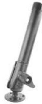
RAM-D-119 RAM TUBE FISHING ROD HOLDER WITH 2 1/4" BALL