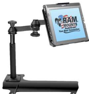
RAM-VB-158-MOT4 VEHICLE SYSTEM FOR THE 2005-NEWER JEEP WRANGLER