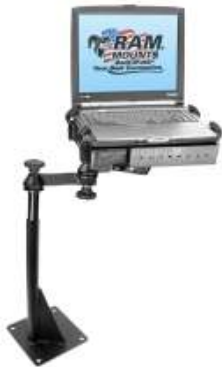
RAM-VBD-122-SW1 VEHICLE SYSTEM UNIVERSAL SQUARE BASE