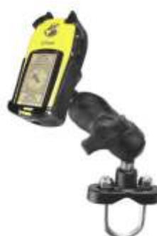
RAM-B-149ZA-GA5U ETREX MOUNT WITH A ARMS AND U-BOLT BASE