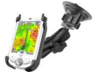
RAM-B-166-CO4 RAM SUCTION MOUNT FOR THE HP IPAQ 1900 & 4100 SERIES