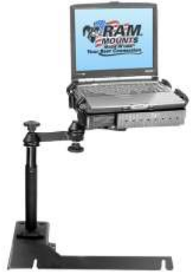
RAM-VB-111-SW1 VEHICLE SYSTEM FOR THE 2000-NEWER IMPALA