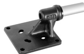
RAM-2461PU RAM SMALL 75 MM VESA PLATE WITH 1/2" POST