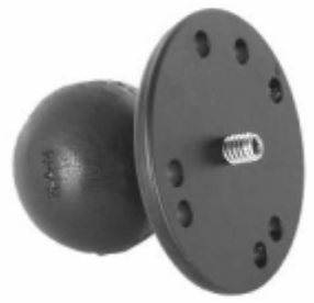
RAM-202A RAM BALL BASE WITH 1/4"-20 STST STUD