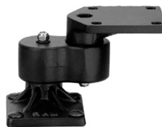
RAM-VB-ADJ1 RAM VEHICLE ADJUST-A-POLE BASE