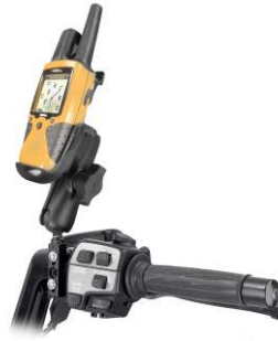
RAM-B-174-GA8 RAM BRAKE/CLUTCH RESERVOIR FOR THE GARMIN RINO