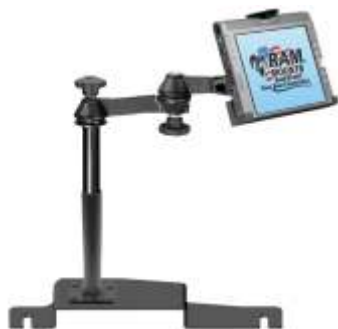
RAM-VB-161-MOT3 VEHICLE SYSTEM FOR THE 2006-NEWER FORD 500 & FREESTYLE