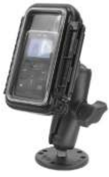
RAM-B-138-AQ3 RAM MOUNT WITH 2 7/16" BASE FOR AQUA BOX MEDIUM