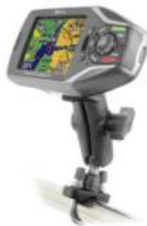
RAM-B-149Z-MA4 RAM RAIL MOUNT FOR THE MAGELLAN ROADMATE