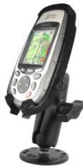
RAM-B-138-MA2 RAM MOUNT FOR THE MAGELLAN MERIDIAN