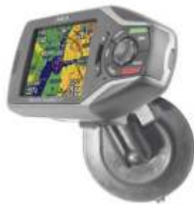
RAM-B-148-MA4 RAM SUCTION MOUNT FOR THE MAGELLAN ROADMATE