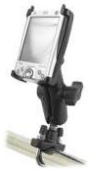
RAM-B-149Z-CO3 RAM U-BOLT MOUNT FOR THE HP 2000 IPAQ