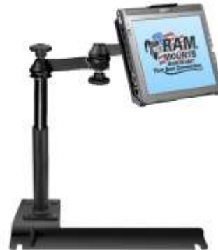
RAM-VB-156-MOT4 VEHICLE SYSTEM FOR THE 2005- NEWER KIA OPTIMA & HYUNDA