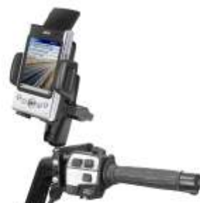
RAM-B-174-UN3 RAM BRAKE/CLUTCH RESERVOIR FOR MEDIUM SIZE DEVICES