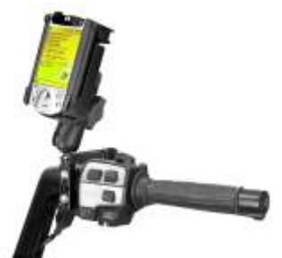
RAM-B-174-CO2 RAM BRAKE/CLUTCH RESERVOIR FOR IPAQ 3000, 5000