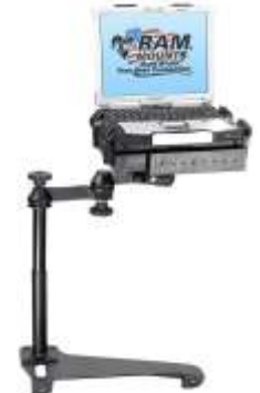
RAM-VB-139-SW1 VEHICLE SYSTEM FOR THE 2004- NEWER HONDA ACCORD