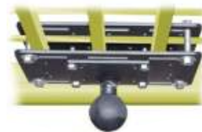
RAM-335 RAM LIFT TRUCK BACK-UP MOUNTING PLATE