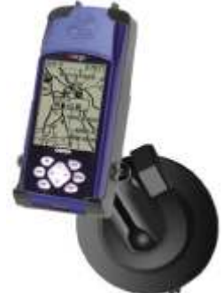
RAM-B-148-GA4 RAM SUCTION MOUNT FOR THE GARMIN E-MAP