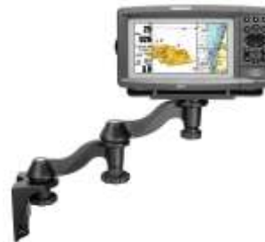
RAM-109V-1 RAM DOUBLE SWING ARM MOUNT SYSTEM WITH VERTICAL BASE