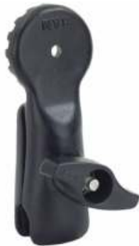
RAM-D-162BAU RAM RATCHET BASE WITH SINGLE SOCKET ARM