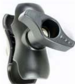
RAM-D-201U-C RAM DOUBLE SOCKET D SHORT ARM