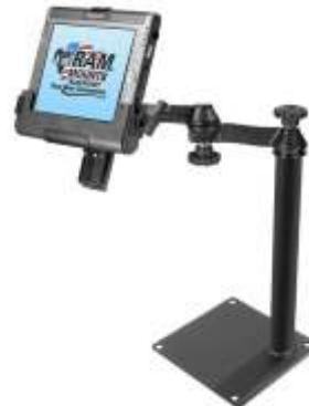
RAM-VBD-125-MOT1 VEHICLE SYSTEM CHEVY PICKUP