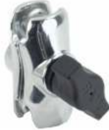
RAM-B-201-ACHU CHROME RAM DOUBLE SOCKET ARM B BALL A LENGTH