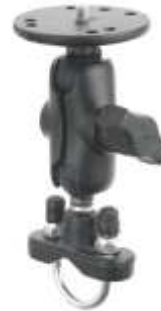
RAM-B-149ZA-C1U RAM MOUNT WITH SHORT ARM AND 1/4"-20