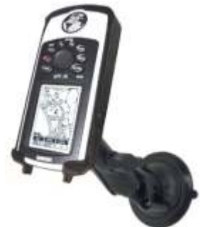
RAM-B-166-GA6 RAM SUCTION MOUNT FOR THE GARMIN 76 & 76CSX