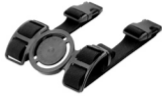
RAM-BM-L1 RAM BODY MOUNT FOR LEGS