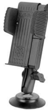
RAM-B-120-224 RAM HAND HELD MOUNT WITH SUCTION CUP BASE