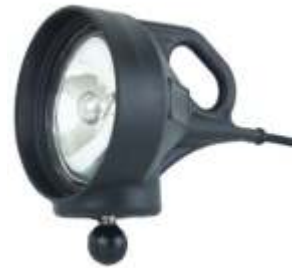
RAM-B-152B RAM SPOTLIGHT WITH 1" BALL