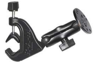
RAM-B-121-202U RAM MOUNT WITH RAM-B-121, B-201, & B-202