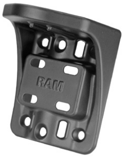
RAM-109V-B RAM VERTICAL SWING ARM MOUNTING BRACKET