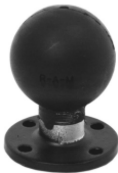
RAM-D-254U 2 7/16" DIAMETER BASE WITH 2 1/4" BALL (AMPS)