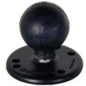
RAM-202SU RAM 2 1/2" DIAMETER STST BASE WITH BALL