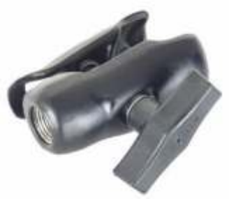
RAM-200-1 RAM SINGLE BALL ARM WITH 1/2" NPT HOLE