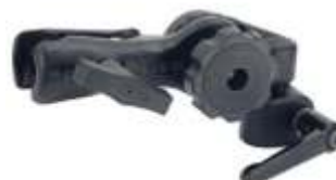
RAM-261-ADJU RAM SWING ARM WITH SINGLE SOCKET RATCHET