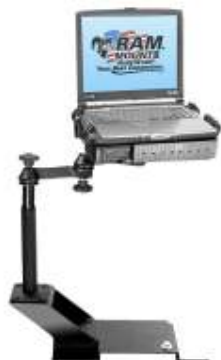
RAM-VB-110-SW1 VEHICLE SYSTEM FOR THE 1997-03 EXPEDITION & F150