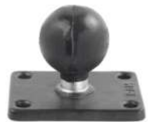
RAM-202U-225 RAM BASE 2" X 2.5" WITH 1 1/2" BALL