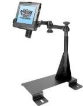
RAM-VB-120-MOT1 VEHICLE SYSTEM FOR THE 2004- NEWER FREESTAR