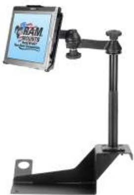
RAM-VB-108-MOT4 VEHICLE SYSTEM FOR THE 2000- NEWER EXCURSION & 1999-NEWER