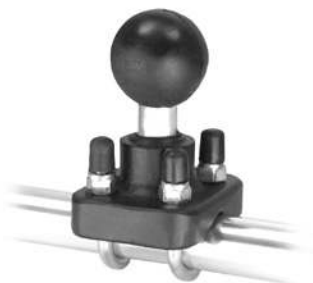
RAM-235 RAM BASE WITH 2 U-BOLTS FOR 3/4 TO 1 1/4