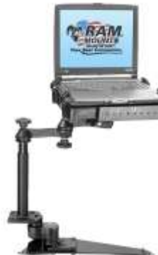
RAM-VB-138ST1-SW1 VEHICLE SYSTEM FOR THE 2006- NEWER TOYOTA FJ CRUISER