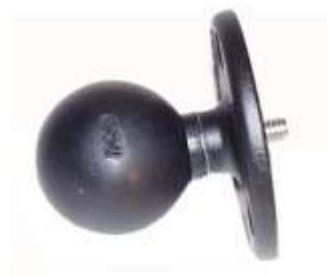
RAM-202C RAM BALL BASE WITH 3/8" -16 STST STUD