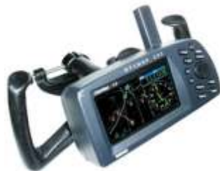
RAM-B-121-G1 RAM YOKE MOUNT WITH MOUNTING HARDWARE