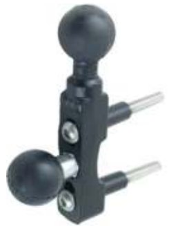
RAM-B-309-6U RAM MODULAR MOTO BASE WITH DOUBLE BALL