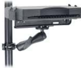
RAM-VPR-102-1 VEHICLE PRINTER SYSTEM FOR THE CANON BJC-85