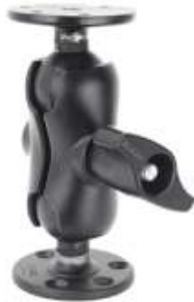
RAM-D-101U-C RAM MOUNT WITH 2 3.68 BASES & C ARM