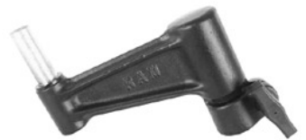
RAM-D-261-DHCPU RAM ARM WITH 1" PIPE FEMALE 1/2" POST