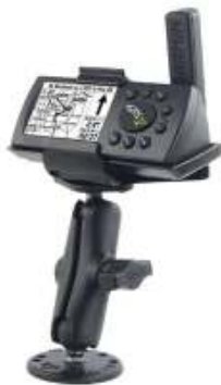
RAM-B-138-GA2 RAM MOUNT FOR GARMIN GPS II & III SERIES