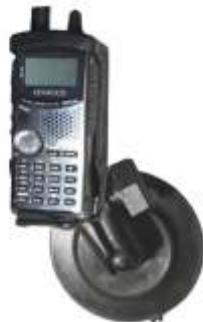
RAM-B-148-KE1 RAM SUCTION MOUNT FOR THE KENWOOD TH-D7A RAD