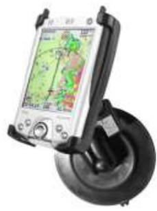
RAM-B-148-CO3 RAM SUCTION MOUNT FOR THE HP 2000 IPAQ