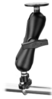
RAM-101U-AC1 RAM MOUNT WITH 1 RAM-202 & 1 RAM-231