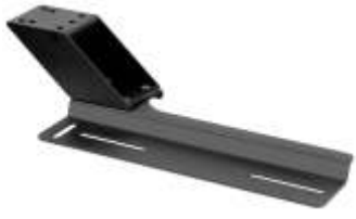
RAM-VB-106R4 VEHICLE BASE FOR THE DODGE SPRINTER VAN