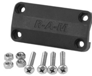
RAM-114RM RAM ROD 2000 RAIL MOUNT ADAPTER KIT