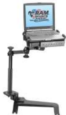
RAM-VB-159-SW1 VEHICLE SYSTEM FOR THE 2007 CHEVY TAHOE