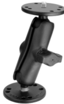
RAM-B-101A RAM 1" MOUNT WITH 2 BASES ONE WITH 1/4-20 STUD