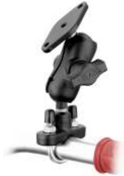
RAM-B-149ZAU RAM RAIL MOUNT WITH A SIZE ARMS