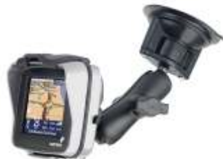
RAM-B-166-TO2U UNPKD RAM SUCTION MOUNT FOR THE TOMTOM RIDER