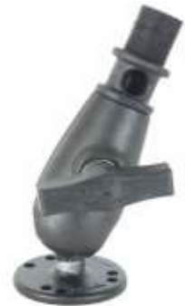
RAM-112-1 RAM SINGLE BALL MOUNT WITH 1/2" NPT HOLE