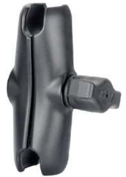
RAM-B-201 RAM DOUBLE SOCKET ARM FOR 1" BALLS