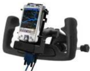
RAM-B-121-CO5P RAM YOKE SYSTEM UNIVERSAL IPAQ SERIES