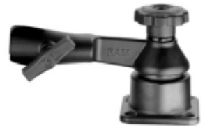
RAM-109HS-4U RAM STRAIT SWING ARM WITH HORIZONTAL BASE