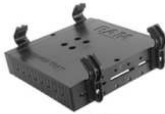
RAM-234-3 RAM UNIVERSAL LAPTOP MOUNT TOUGH TRAY