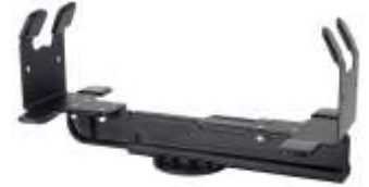
RAM-VPR-103 VEHICLE PRINTER BASE FOR THE HP- 450