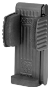
RAM-120B RAM HOLDER WITH QUICK RELEASE