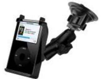
RAM-B-166-AP1 RAM SUCTION MOUNT FOR THE APPLE IPOD