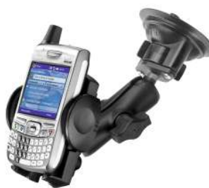
RAM-B-166-UN1 RAM UNIVERSAL SUCTION MOUNT FOR SMALL SIZE DEVICES