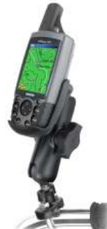
RAM-B-149Z-GA12 RAM RAIL MOUNT FOR THE GARMIN 60 SERIES