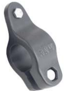
RAM-D-264U RAM TRI & BI-POD LEG CONNECTOR 1" PIPE