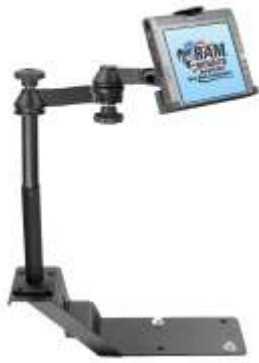
RAM-VBD-101-MOT3 DRILL TYPE SYSTEM DOUBLE SWING