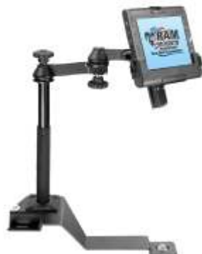
RAM-VB-114-MOT1 VEHICLE SYSTEM FOR THE 2002-NEWER TRAIL BLAZER & ENVOY