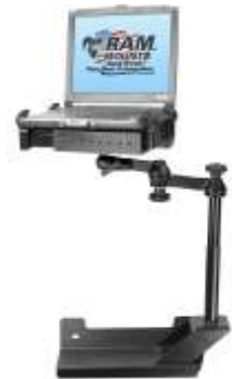
RAM-VB-104-SW1 VEHICLE SYSTEM FOR THE RAM 1500 & RAM 2500/3500