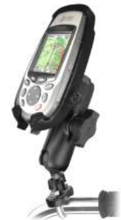
RAM-B-149Z-MA2 RAM U-BOLT MOUNT FOR THE MAGELLAN MERIDIAN