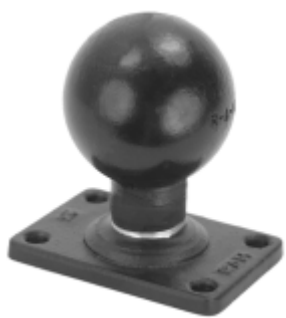
RAM-D-202U-23 RAM BASE 2" X 3" WITH 2 1/4" DIAMETER BALL