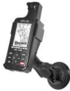
RAM-B-166-MA1 RAM SUCTION MOUNT FOR THE MAGELLAN 12,300 & 315