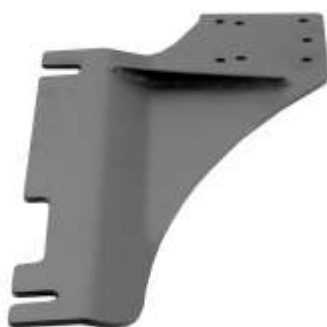
RAM-VB-160 VEHICLE BASE FOR THE 2006-NEWER CHEVY IMPALA