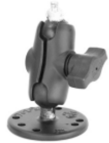
RAM-B-101-A-237PU RAM MOUNT WITH 1 1/4"-20 BASE & 1 SHORT PSA