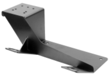
RAM-VB-108 VEHICLE BASE FOR THE 2000-NEWER EXCURSION & 1999-NEWER F250