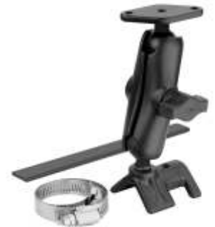
RAM-B-108U-GP1 UNPKD RAM MOUNT WITH B-238 BASE