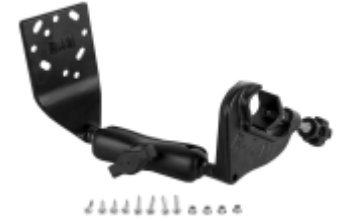
RAM-B-125-G1 RAM YOKE CLAMP WITH MOUNTING HARDWARE