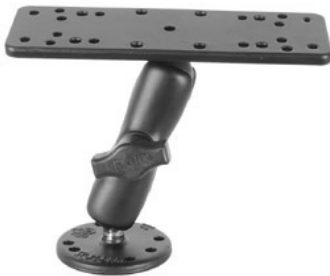
RAM-B-111 RAM UNIVERSAL ELECTRICAL MOUNT 6 1/4" X 2"