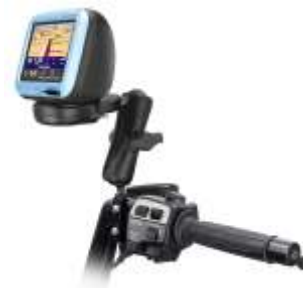
RAM-B-174-TO1 RAM BRAKE/CLUTCH RESERVOIR FOR THE TOMTOM GO