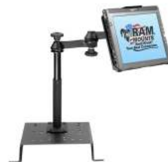
RAM-VB-115-MOT4 VEHICLE SYSTEM FOR THE 1995-NEWER TAURUS