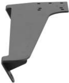
RAM-VB-153 VEHICLE BASE FOR THE 2005-NEWER TOYOTA SIENNA