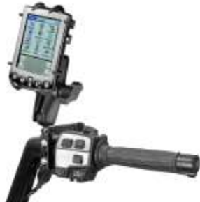
RAM-B-174-PD3 RAM BRAKE/CLUTCH RESERVOIR UNIVERSAL PDA