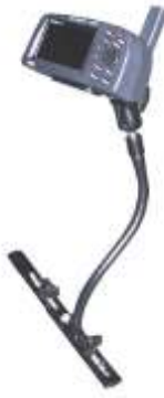
RAM-B-131-G1 RAM AIRCRAFT SEAT RAIL MOUNT FOR GPS