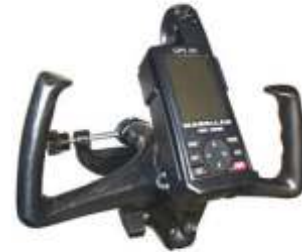
RAM-B-125-MA1 RAM YOKE WITH CRADLE FOR MAGELLAN 315A