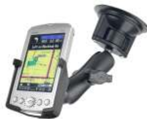
RAM-B-166-GA10 RAM SUCTION MOUNT FOR THE GARMIN IQUE