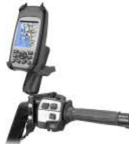
RAM-B-174-LO3 RAM BRAKE/CLUTCH RESERVOIR FOR THE LOWRANCE IFINDER H2O & MAP