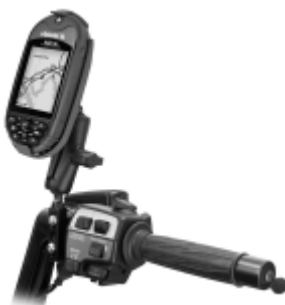
RAM-B-174-MA6 RAM BRAKE/CLUTCH RESERVOIR FOR THE MAGELLAN EXPLORIST XL