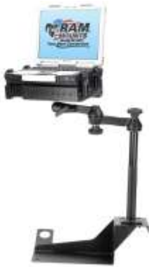
RAM-VB-108-SW1 VEHICLE SYSTEM FOR THE 2000- NEWER EXCURSION & 1999-NEWER F250