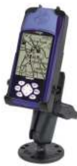
RAM-B-138-GA4 RAM MOUNT FOR GARMIN E-MAP