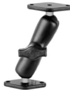
RAM-B-102 RAM EVERYTHING MOUNT WITH 1" BALLS