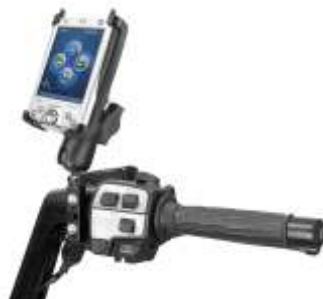
RAM-B-174-CO3 RAM BRAKE/CLUTCH RESERVOIR FOR THE HP IPAQ 2000 SERIES