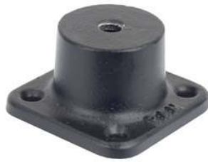
RAM-109H-B RAM SINGLE ARM BALL MOUNT WITH HORIZONTAL BASE