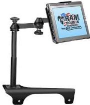
RAM-VB-165-MOT4 VEHICLE SYSTEM FOR THE 2006- NEWER HUMMER H3