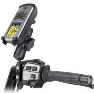
RAM-B-174-GA14 RAM BRAKE/CLUTCH RESERVOIR FOR THE GARMIN GPS 76CS