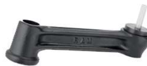
RAM-109U-G3 6" SWING ARM EXTENSION