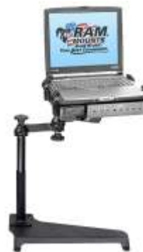
RAM-VB-151 VEHICLE BASE SEATS INC.