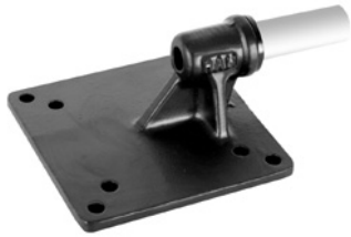
RAM-246PU RAM VESA PLATE WITH 1/2" POST