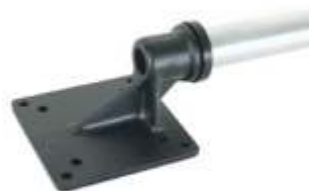
RAM-D-246PU VESA PLATE WITH 1" POST