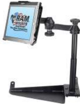
RAM-VB-134-MOT4 VEHICLE SYSTEM FOR THE 2006- NEWER NISSAN TITAN