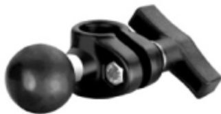
RAM-330U RAM 1/2" PIPE CLAMP WITH 1 1/2" BALL