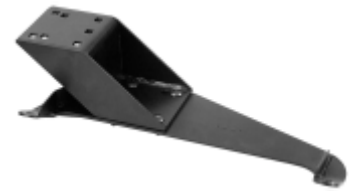
RAM-VB-138 VEHICLE BASE FOR THE 2006-NEWER TOYOTA 4-RUNNER