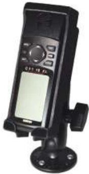
RAM-B-138-GA1 RAM MOUNT FOR GARMIN GPS 12 SERIES