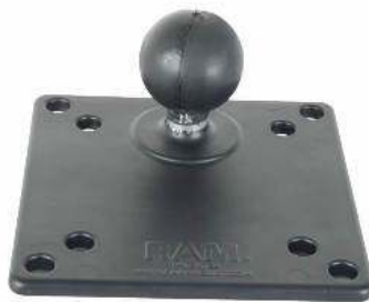
RAM-246U RAM 4.75 SQUARE VESA BASE 100 & 75 HOLE