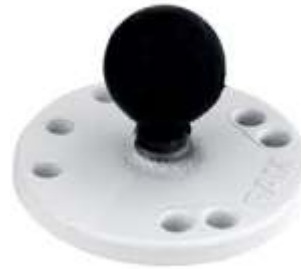
RAM-B-202WU WHITE RAM 2 7/16" DIAMETER BASE WITH 1" BALL