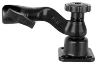
RAM-109H-4U RAM BENT SWING ARM WITH HORIZONTAL BASE