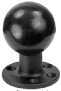
RAM-E-202U RAM 3.68 DIAMETER BASE WITH 3 3/8" BALL