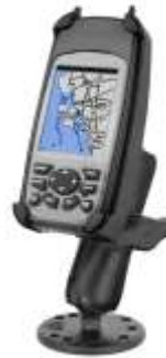
RAM-B-138-LO3 RAM MOUNT FOR THE FOR LOWRANCE IFINDER H20