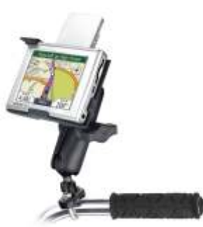
RAM-B-149Z-GA21 RAM U-BOLT FOR THE GARMIN NUVI