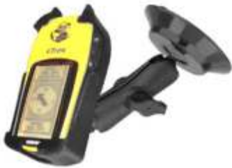
RAM-B-148-GA5 RAM SUCTION MOUNT FOR THE GARMIN E-TREX