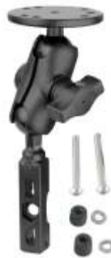
RAM-B-174-202AU RAM GOLDWING WITH 1/4"-20 MALE CAMERA MOUNT