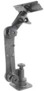
RAM-D-162H-MC1 RAM MC MASTER CARR SWING ARM HORIZONTAL SYSTEM