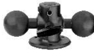
RAM-217 RAM DOUBLE BALL WITH 2 1/2" DIAMETER BASE & KNOB