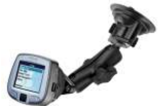
RAM-B-166-GA22 RAM SUCTION MOUNT FOR THE GARMIN STREETPILOT I SERIES