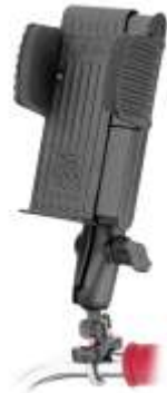
RAM-B-120-231Z RAM HAND HELD MOUNT WITH ZINC U-BOLT CLAMP