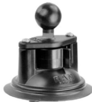
RAM-B-224-1U RAM 3.3" DIAMETER SUCTION CUP WITH 1" METAL BALL