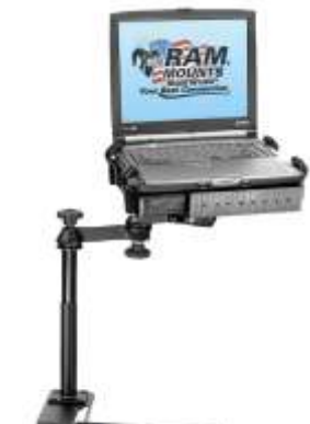
RAM-VB-155-SW1 VEHICLE SYSTEM FOR THE 2006- NEWER HONDA CIVIC