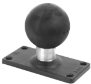
RAM-D-202U-24 RAM BASE 2" X 4" WITH 2 1/4" DIAMETER BALL