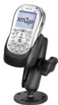
RAM-B-138-XM1 RAM MOUNT FOR XM SATELLITE RADIOS