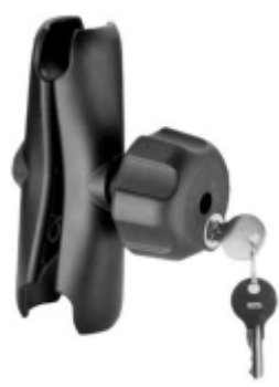
RAM-201U-BL RAM DOUBLE SOCKET ARM C BALL B LOCK