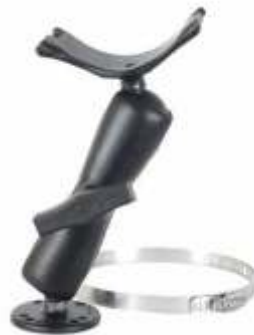
RAM-118 RAM SYSTEM FOR LANTERNS