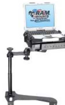
RAM-VB-135MH1-SW1 VEHICLE SYSTEM FOR THE 2006- NEWER HONDA ELEMENT