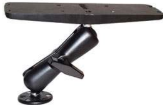
RAM-137U RAM MOUNT WITH 3" X 11" X 2 1/2" BASE