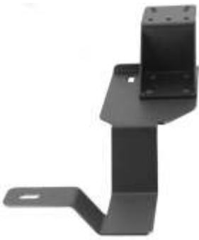
RAM-VB-101 VEHICLE BASE FOR THE 1995-NEWER SONOMA BLAZER & S10 JIMMY