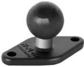
RAM-B-238U-500 500 BULK 2-7/16" X 1-5/16" BASES WITH BALL