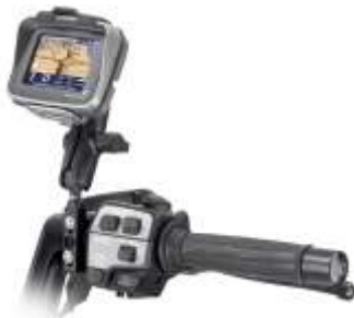
RAM-B-174-TO2U UNPKD BRAKE/CLUTCH RESERVOIR FOR THE TOMTOM RIDER