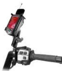
RAM-B-174-CO1 RAM BRAKE/CLUTCH RESERVOIR FOR THE HP IPAQ 3600 & 5000 SERIES