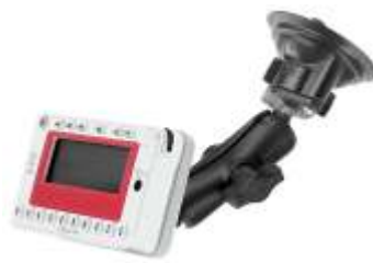
RAM-B-166-XM1 RAM SUCTION MOUNT FOR XM SATELLITE RADIOS