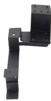
RAM-VB-102 VEHICLE BASE FOR THE 2000-NEWER 2500 & 3500 SUBURBAN