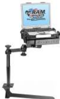
RAM-VB-154-SW1 VEHICLE SYSTEM FOR THE 2004- NEWER NISSAN PATHINDER & XTERRA