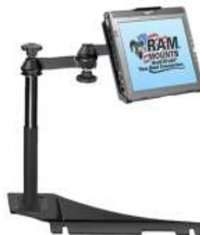
RAM-VB-160-MOT4 VEHICLE SYSTEM FOR THE 2006-NEWER CHEVY IMPALA