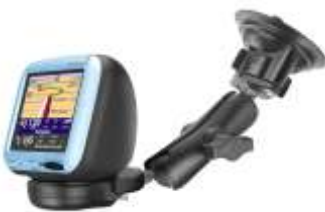
RAM-B-166-TO1 RAM SUCTION MOUNT FOR THE TOMTOM GO