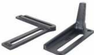
RAM-160BBU RAM SEAT RAIL BRACKETS ONLY