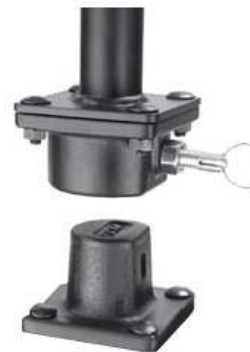
RAM-VB-REM1 RAM VEHICLE REMOVE-A-POLE BASE