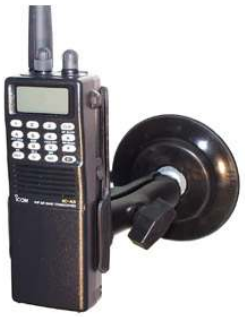
RAM-B-148-BC1 RAM WITH SUCTION, BELT CLIP HOLDER HAND-HELD