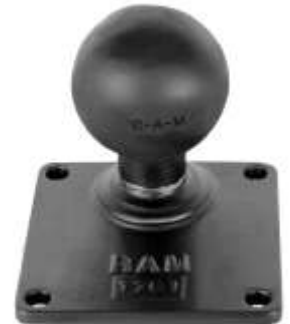
RAM-D-2461U RAM 3 5/8" SQ. 75 MIL. VESA BASE WITH BALL