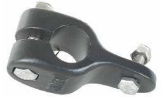
RAM-266U RAM TRI & BI-POD LEG CONECTOR PEDESTAL