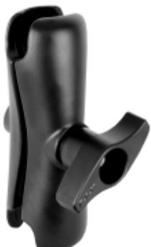
RAM-D-201U RAM DOUBLE SOCKET ARM D BALLS