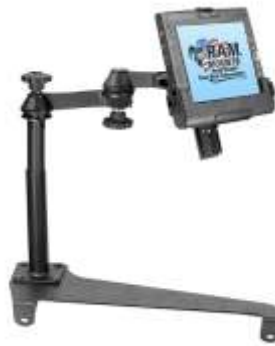
RAM-VB-133-MOT1 VEHICLE SYSTEM FOR THE 2006- NEWER TOYOTA TUNDRA