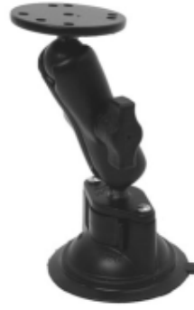
RAM-B-101-2241U RAM MOUNT WITH TWIST LOCK CUP