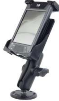
RAM-B-138-PD1U RAM MOUNT WITH UNIVERSAL PDA CRADLE