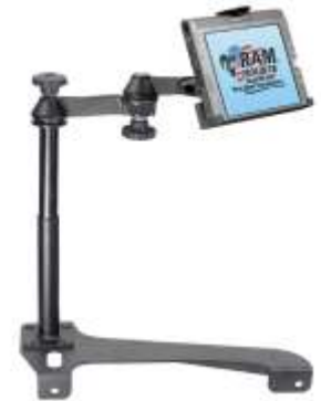
RAM-VB-135-MOT3 VEHICLE SYSTEM FOR THE 2006- NEWER HONDA CRV