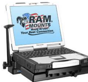
RAM-234-PAN1M RAM PANASONIC LAPTOP MOUNT TOUGH TRAY METAL