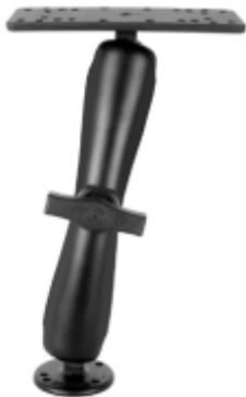
RAM-111-D RAM MOUNT WITH 1.5" BALLS & D LENGTH ARM