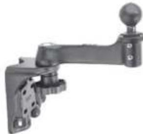
RAM-109V-2BU RAM SWING ARM SYSTEM WITHOUT DOUBLE ARM AND VERTICAL BASE