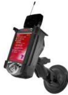
RAM-B-166-CO1 RAM SUCTION MOUNT FOR THE HP IPAQ