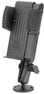
RAM-B-120 RAM HAND HELD MOUNT WITH 1"