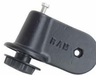
RAM-D-162SU RAM SWIVEL BASE WITH RATCHET FEATURE