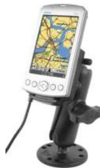
RAM-B-138-GA11 RAM MOUNT GARMIN ADAPTER