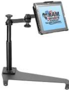
RAM-VB-153-MOT4 VEHICLE SYSTEM FOR THE 2005- NEWER TOYOTA SIENNA