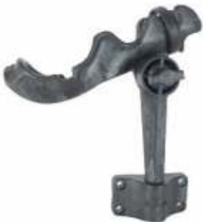
RAM-114-B RAM ROD 2000 ROD HOLDER WITH BULKHEAD MOUNT