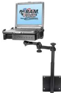
RAM-VBD-128-SW1 RAM UNIVERSAL DRILL TYPE FLAT VERTICAL BASE