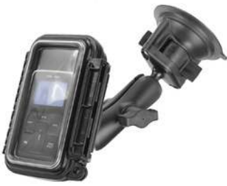
RAM-B-166-AQ3 RAM SUCTION MOUNT SMALL SIZE AQUA BOX