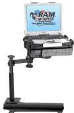
RAM-VB-158-SW1 VEHICLE SYSTEM FOR THE 2005-NEWER JEEP WRANGLER