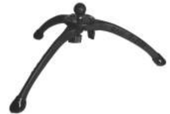
RAM-B-205U TRI-POD WITH 1" BALL