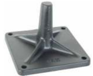
RAM-283U RAM 5" X 5" BASE WITH MALE POST FOR TEL POST