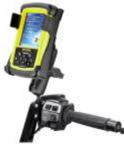
RAM-B-174-TD1 RAM BRAKE/CLUTCH RESERVOIR FOR THE TDS RECON