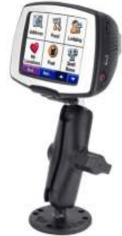
RAM-B-138-GA19U RAM MOUNT FOR GARMIN C320, C330, C340