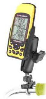
RAM-B-149Z-LO2 RAM U-BOLT MOUNT FOR THE LOWRANCE IFINDER