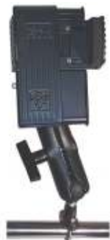
RAM-120-231 RAM HAND HELD MOUNT WITH U-BOLT RAIL CLAMP