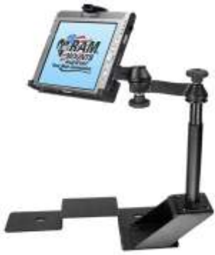
RAM-VB-109-MOT3 VEHICLE SYSTEM FOR THE 2004-NEWER F150