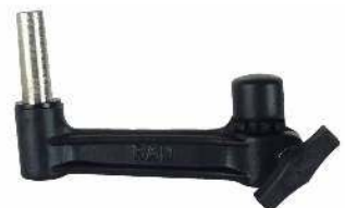
RAM-261-1U RAM 6" EXTENSION SWING ARM 1/2" PIPE