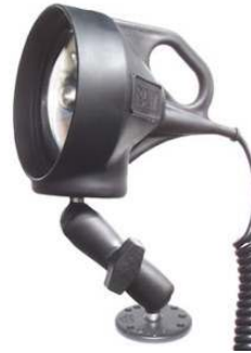
RAM-B-152 RAM SPOTLIGHT WITH MOUNT & STUD BASE