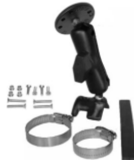
RAM-B-108-G1 RAM WITH V BASE & MOUNTING HARDWARE