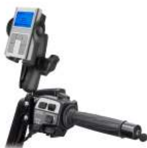
RAM-B-174-UN1 RAM BRAKE/CLUTCH RESERVOIR FOR SMALL SIZE DEVICES