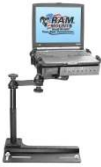
RAM-VB-106-SW1 VEHICLE SYSTEM FOR THE 1993- NEWER CAMARO & 1991-NEWER CROWN VIC