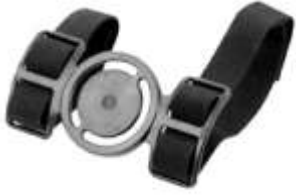
RAM-BM-A1 RAM BODY MOUNT FOR ARMS