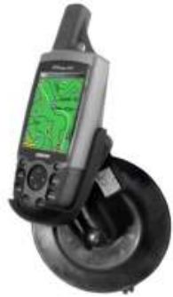
RAM-B-148-GA12 RAM SUCTION MOUNT FOR THE GARMIN 60 SERIES