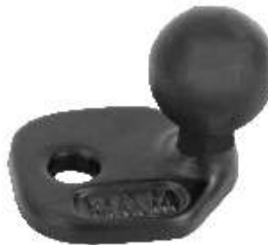
RAM-B-126CU RAM 1.5 X 1.75 BASE 5/16" HOLE & 1"