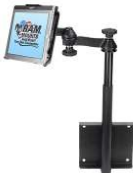
RAM-VBD-128-MOT4 RAM UNIVERSAL DRILL TYPE FLAT VERTICAL BASE