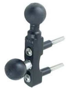
RAM-B-309-2 RAM MOTORCYCLE HANDLEBAR BASE WITH 2 BALLS