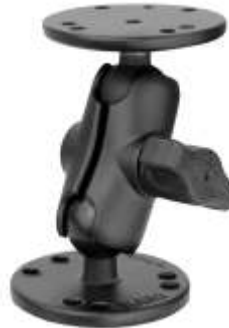
RAM-B-101A2U RAM MOUNT WITH 2-B-202A BASES