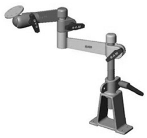
RAM-161-2U RAM BI-POD SYSTEM WITH DOUBLE SWING ARM & BALL