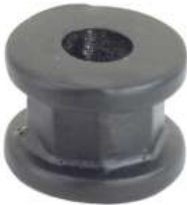
RAM-280U RAM DOUBLE THICK OCTAGON BUTTON