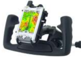
RAM-B-121-PD3 RAM YOKE SYSTEM UNIVERSAL PDA MOUNT