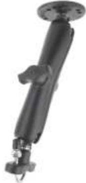
RAM-B-101-C-231ZU RAM MOUNT WITH B-202 AND B-231Z BASE