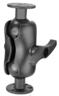
RAM-E-101U-D RAM MOUNT WITH 2 3.68 BASES & SHORT ARMS