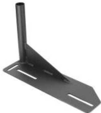
RAM-VB-117 VEHICLE BASE FOR THE 1993-NEWER CAMARO & 1991-NEWER CROWN VIC