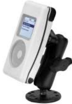
RAM-B-138-OT1 RAM MOUNT FOR THE OTTERBOX