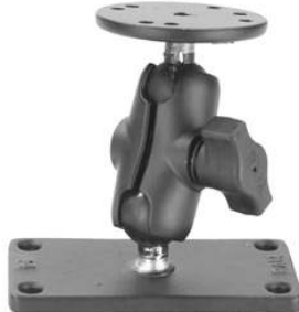
RAM-B-101-A-24U RAM MOUNT WITH 1 2" X 4" BASE & 1 SHORT ARM