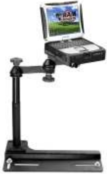
RAM-VB-106-PAN2 VEHICLE SYSTEM TOUGH DOCK CF- 18