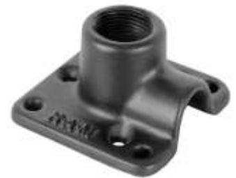
RAM-D-232-90U RAM BASE WITH 1" NPT 90 DEGREE HOLE