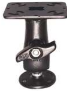
RAM-D-112-D RAM MOUNT WITH PLATE FOR DOWNRIGGERS