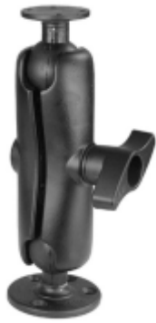
RAM-D-101-254U RAM MOUNT WITH 3.68 BASE & 2.5 BASE