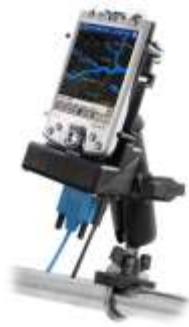
RAM-B-149Z-CO5P RAM RAIL MOUNT SYSTEM UNIVERSAL IPAQ SERIES