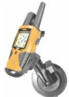
RAM-B-148-GA8 RAM SUCTION MOUNT FOR THE GARMIN RINO