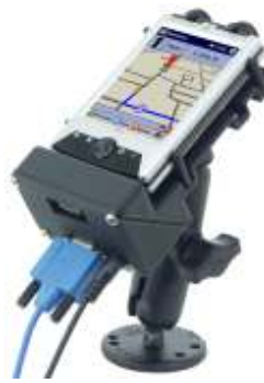
RAM-B-138-CO5P RAM STUD MOUNT FOR POWERED IPAQ FAMILY