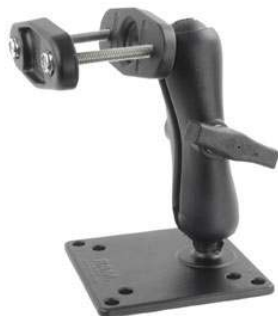
RAM-246-247U-25 RAM MOUNT VESA PLATE SQUARE TUBE