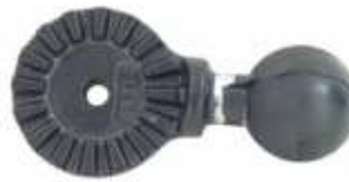
RAM-D-162B-DU RAM RATCHET BASE WITH 2 1/4" BALL