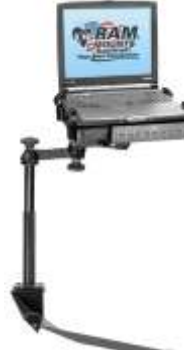
RAM-VB-144-SW1 VEHICLE SYSTEM FOR THE 2006- NEWER KIA SORENTO