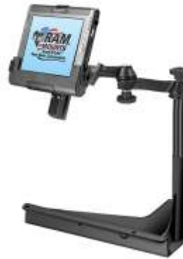
RAM-VB-164-MOT1 VEHICLE SYSTEM 2005-NEWER SEARS SEATING