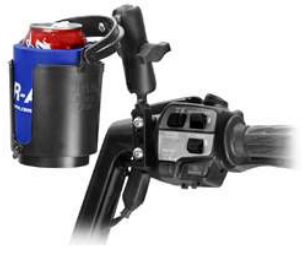
RAM-B-132-309U RAM DRINK CUP HOLDER WITH GOLDWING