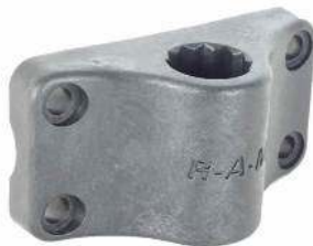
RAM-114BM RAM ROD 2000 BULKHEAD MOUNTING BASE