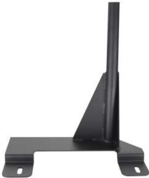
RAM-VB-119 VEHICLE BASE FOR THE 1995-NEWER ECONOLINE VAN