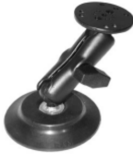
RAM-B-101-224 RAM 1" BALL MOUNT WITH 4" SUCTION CUP