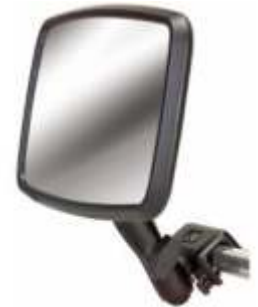
RAM-B-126 RAM WATER SKI MIRROR WITH WINDSHIELD BRACKET