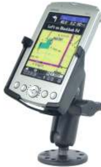
RAM-B-138-GA10 RAM MOUNT FOR GARMIN IQE