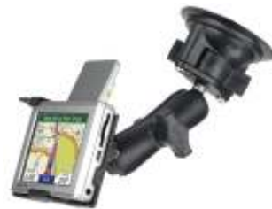
RAM-B-166-GA21 RAM SUCTION MOUNT FOR THE GARMIN NUVI