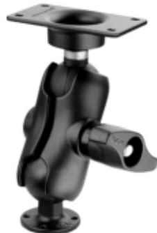
RAM-D-101U-C-243 RAM MOUNT WITH D-243, D-201-C, D-254 & SHORT ARM