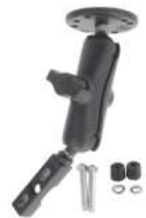
RAM-B-174-202U RAM GOLDWING WITH 2.5 DIAMETER BASE