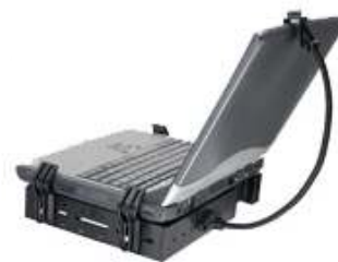
RAM-234-SU RAM SCREEN SUPPORT SYSTEM