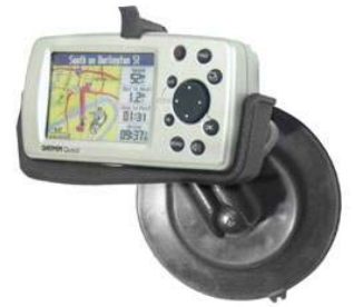
RAM-B-148-GA15U RAM SUCTION FOR THE GARMIN QUEST