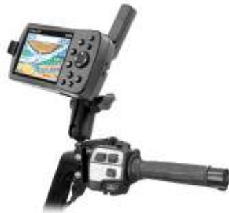
RAM-B-174-GA7 RAM BRAKE/CLUTCH RESERVOIR FOR THE GARMIN 176, 276 & 296