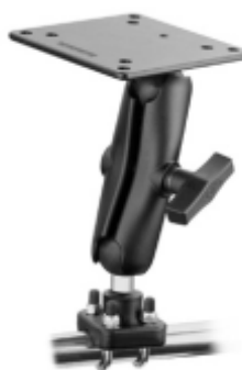
RAM-334U RAM MOUNT WITH RAM-2461 & 1 RAM-235