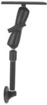
RAM-134-0 RAM 0 DEGREE BASE, 6" PIPE DOUBLE SOCKET MOUNT