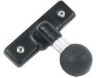
RAM-B-145B RAM BASE WITH 1" BALL FOR THE GARMIN STREETPILOT