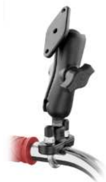
RAM-B-102-231Z RAM MOUNT WITH B-102 & XTRA B-231Z