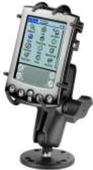
RAM-B-138-PD3 RAM STUD MOUNT FOR THE UNIVERSAL IPAQ FAMILY