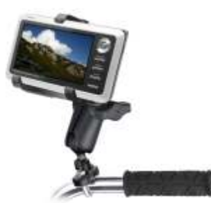
RAM-B-149Z-PD2 RAM MOUNT THREE FINDER PDA HOLDER