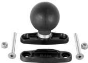
RAM-D-247U-15 RAM CLAMP BASE WITH BALL 1.5" MAXIMUM WIDTH