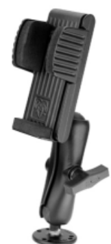
RAM-120 RAM SYSTEM WITH QUICK RELEASE HAND HELDS