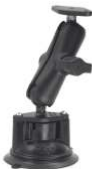
RAM-B-166 RAM SUCTION MOUNT TWIST LOCK