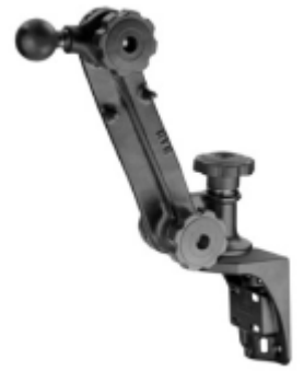
RAM-162V-MC4 RAM RATCHET SWING ARM WITH 1 1/2" BALL