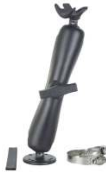
RAM-108-D RAM TROLLING MOTOR STABILIZER WITH LONG ARM