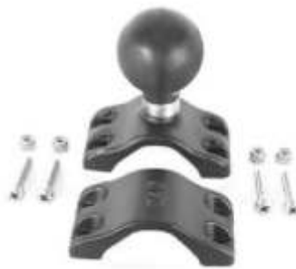
RAM-D-271U-2 RAM 2" - 2 1/2" DIAMETER RAIL BASE WITH BALL