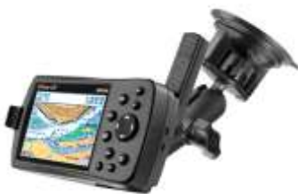
RAM-B-166-GA7 RAM SUCTION MOUNT FOR THE GARMIN 176, 276 & 296