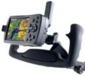
RAM-B-121-GA7 RAM YOKE MOUNT FOR 176, 276, 296