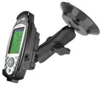
RAM-B-148-MA3 RAM SUCTION MOUNT FOR THE MAGELLAN SPORTRAK