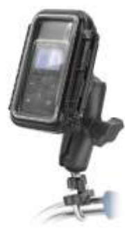
RAM-B-149Z-AQ3 RAM U-BOLT MOUNT SMALL SIZE AQUA BOX