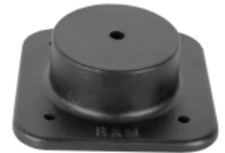
RAM-D-162HU RAM HORIZONTAL RATCHET SWING ARM BASE