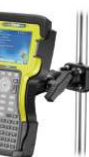
RAM-103-B-235-TD2 RAM DOUBLE RAIL MOUNT FOR THE TDS RANGER