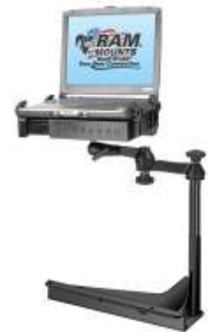
RAM-VB-164 VEHICLE BASE 2005-NEWER SEARS SEATING