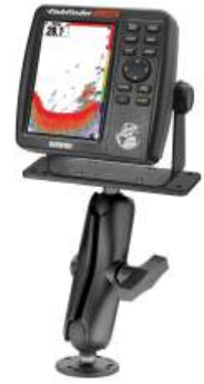
RAM-111 RAM UNIVERSAL ELECT. MOUNT 6 1/4" X 2"