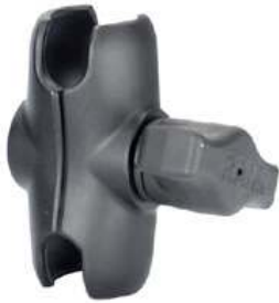
RAM-B-201-A RAM DOUBLE SOCKET ARM B BALL A LENGTH