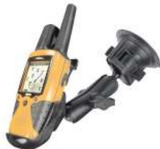
RAM-B-166-GA8 RAM SUCTION MOUNT FOR THE GARMIN RINO