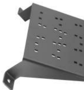
RAM-VB-115 VEHICLE BASE FOR THE 1995-NEWER TAURUS