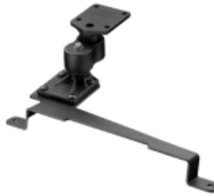
RAM-VB-163 VEHICLE BASE FOR THE 2005- NEWER HONDA PILOT