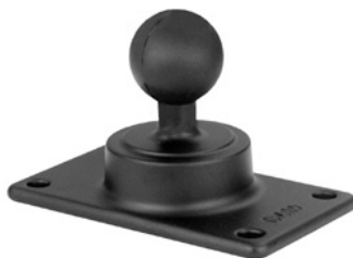
RAM-243 2 13/16" X 5" PLATE WITH BALL