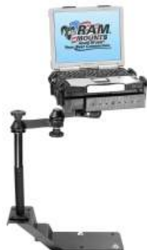
RAM-VBD-101-SW1 DRILL TYPE SYSTEM DOUBLE SWING ARM