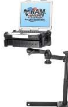
RAM-VB-105-SW1 VEHICLE SYSTEM FOR THE 1997-NEWER DAKOTA & DURANGO