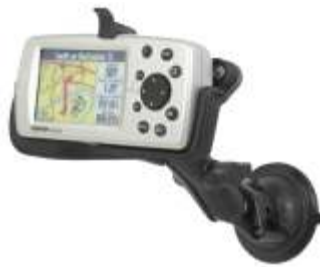
RAM-B-166-GA15 RAM SUCTION MOUNT FOR THE GARMIN QUEST