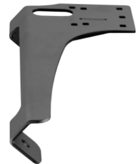
RAM-VB-166 VEHICLE BASE FOR THE 2006-NEWER FORD EXPEDITION