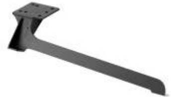
RAM-VB-154 VEHICLE BASE FOR THE 2004- NEWER NISSAN PATHINDER & XTERRA