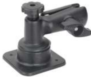
RAM-D-162H-MC3 RAM HORIZONTAL SWING ARM SYSTEM WITHOUT BALL BASE