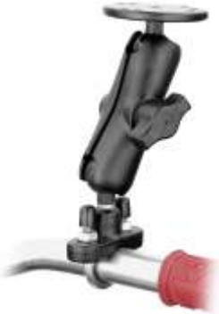
RAM-B-101U-CR1 RAM MOUNT WITH 2 RAM-B-202 AND B-231