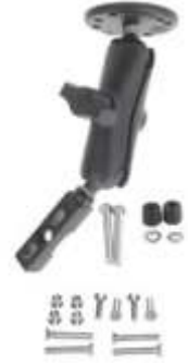
RAM-B-174-G1U RAM GOLDWING WITH AMPS AND HARDWARE