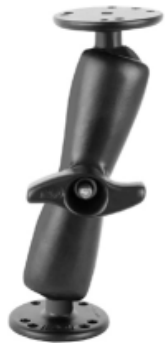
RAM-101MU RAM MOUNT WITH METAL KNOB