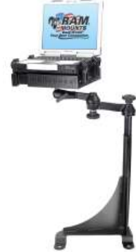
RAM-VB-143-SW1 VEHICLE SYSTEM FOR THE 200 NEWER- EXPRESS SAVANA VAN