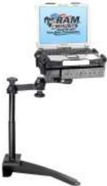
RAM-VB-142-SW1 VEHICLE SYSTEM FOR THE 2005- NEWER GRAND CHEROKEE