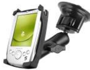
RAM-B-166-DE1 RAM SUCTION MOUNT FOR THE DELL AXIM X5