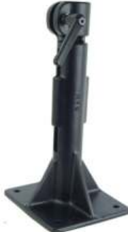
RAM-D-164BU RAM 90 DEGREE BASE WITH TELESCOPING PEDESTAL