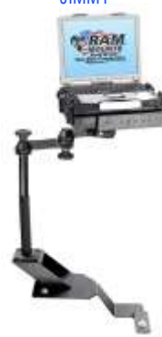
RAM-VB-101-SW1 VEHICLE SYSTEM FOR THE 1995-NEWER SONOMA BLAZER & S10 JIMMY