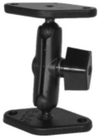
RAM-A-101 RAM DBL. BALL MOUNT WITH 9/16" BALLS