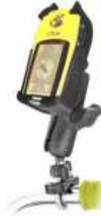
RAM-B-149Z-GA5 RAM MOUNT WITH U-BOLT FOR THE GARMIN E-TREX