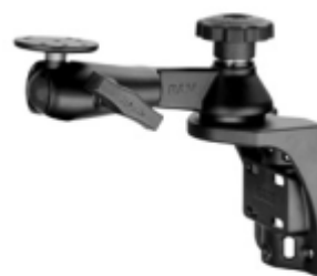
RAM-109V-3U RAM SWING ARM WITH VERTICAL BASE & BALL