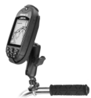
RAM-B-149Z-MA6 RAM RAIL MOUNT FOR THE MAGELLAN EXPLORIST XL