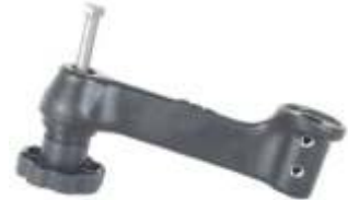
RAM-109-1ATU RAM SINGLE SWING EXTENSION ARM NO BEND