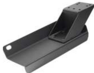
RAM-VB-116 VEHICLE BASE FOR THE 2004-NEWER COLORADO