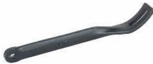
RAM-267U-L2 RAM 12" TRI & BI-POD LEG