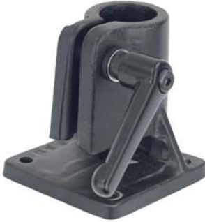
RAM-D-299-SBU RAM 3.5" X 3.5" BASE WITH 1" PIPE FEMALE