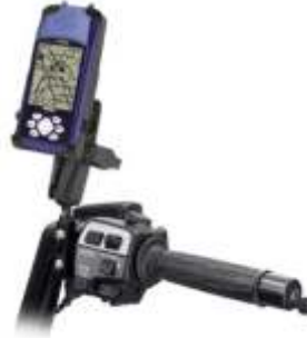
RAM-B-174-GA4 RAM BRAKE/CLUTCH RESERVOIR FOR THE GARMIN E-MAP