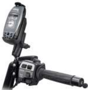
RAM-B-174-MA5 RAM BRAKE/CLUTCH RESERVOIR FOR THE MAGELLAN EXPLORIST SERIES