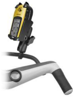
RAM-B-175-GA5U RAM ETREX HOLDER WITH SEGWAY BASE