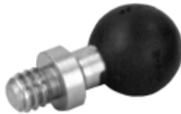
RAM-A-237U RAM 9/16" BALL WITH 1/4"-20 STUD