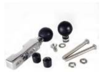
RAM-B-309-2CHU CHROME CYCLE HANDLEBAR BASE WITH 2 BALLS