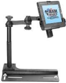
RAM-VB-106-MOT1 VEHICLE SYSTEM FOR THE 1993- NEWER CAMARO & 1991-NEWER CROWN VIC