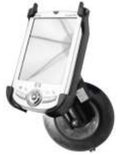
RAM-B-148-CO4 RAM SUCTION MOUNT FOR THE 1900 AND 4100 SERIES