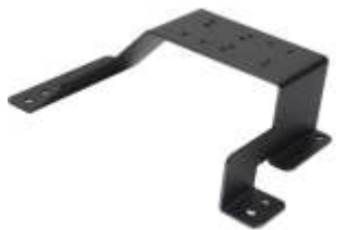
RAM-VB-107 VEHICLE BASE FOR THE 1990-95 CAPRICE & 1991 CROWN VIC