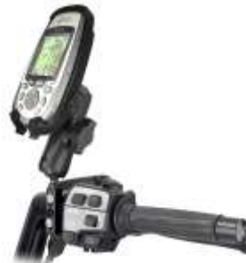
RAM-B-174-MA2 RAM BRAKE/CLUTCH RESERVOIR FOR THE MAGELLAN MERIDIAN