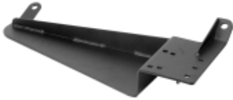
RAM-VB-134 VEHICLE BASE FOR THE 2006-NEWER NISSAN TITAN