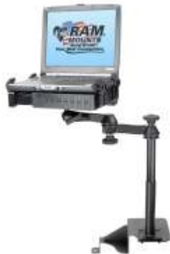
RAM-VB-141-SW1 VEHICLE SYSTEM FOR THE 2003- NEWER JEEP LIBERTY