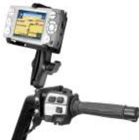
RAM-B-174-PD2 RAM BRAKE/CLUTCH RESERVOIR THREE FINDER PDA HOLDER