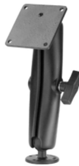
RAM-101U-D-2461 RAM MOUNT WITH VESA PLATE 75 MM D LENGTH