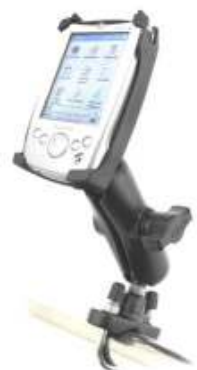
RAM-B-149Z-DE1 RAM U-BOLT MOUNT FOR THE DELL AXIM X5