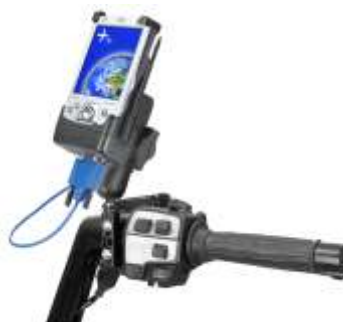
RAM-B-174-CO3P RAM BRAKE/CLUTCH RESERVOIR POWERED DOCK FOR THE HP IPAQ 2000 SERIES