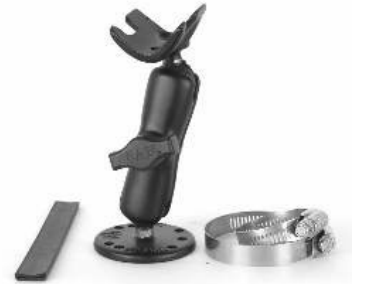
RAM-B-108 RAM WITH STUD BASE & V BASE WITH STRAPS 1/2-2