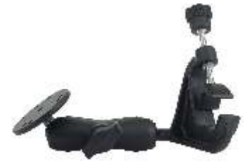
RAM-B-121U RAM YOKE MOUNT WITH BALL & ARM ASSEMBLY