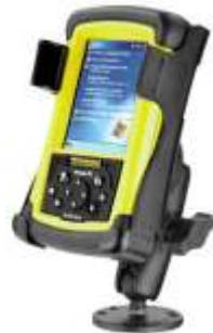
RAM-B-101U-TD1 RAM MOUNT WITH 2 2 1/2" BASES TDS RECON