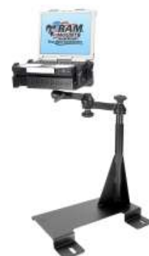
RAM-VB-120-SW1 VEHICLE SYSTEM FOR THE 2004- NEWER FREESTAR