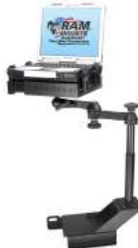
RAM-VB-113-SW1 VEHICLE SYSTEM FOR THE 1994-NEWER RANGER