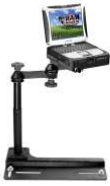
RAM-VB-107-PAN2 VEHICLE SYSTEM TOUGH DOCK CF- 18