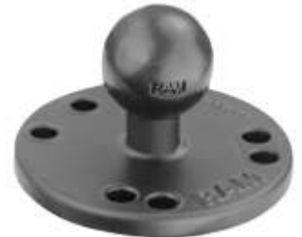
RAM-B-202 RAM 2 1/2" DIAMETER BASE WITH 1" BALL