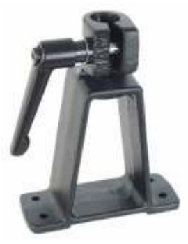
RAM-161BU RAM BI-POD BASE WITH NO PEDESTAL OR BALL