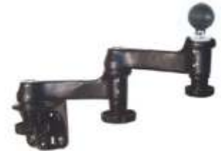
RAM-109V-1BU RAM DOUBLE SWING ARM WITH 1 1/2" AND VERTICAL BASE BALL