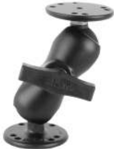
RAM-101U-B RAM MOUNT WITH 2 2 1/2" BASES & B ARM