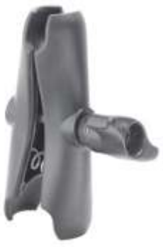
RAM-201MU DOUBLE SOCKET ARM WITH METAL KNOB