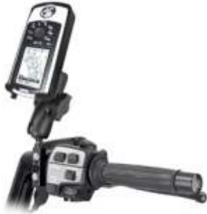
RAM-B-174-GA6 RAM BRAKE/CLUTCH RESERVOIR FOR THE GARMIN 76 & 76CSX