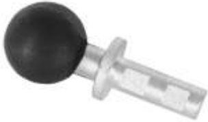
RAM-208 RAM BALL WITH 5/8" OD POST FOR PHOTO LIGHT