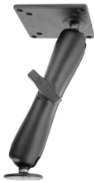
RAM-101U-D-246 RAM MOUNT LONG ARM VESA PLATE