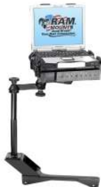
RAM-VB-145-SW1 VEHICLE SYSTEM FOR THE 2006- NEWER CHRYSLER 300