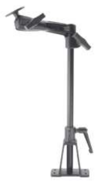
RAM-161-1U RAM BI-POD SYSTEM WITH SINGLE