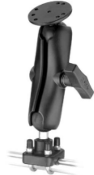
RAM-101U-235 RAM MOUNT WITH 2 RAM-202 & 1 RAM-235