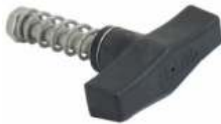
RAM-2-1U RAM T HANDLE, BOLT, WASHER & SPRING