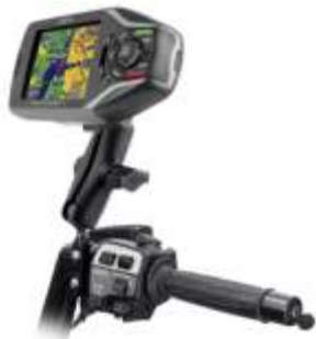
RAM-B-174-MA4 RAM BRAKE/CLUTCH RESERVOIR FOR THE MAGELLAN ROADMATE