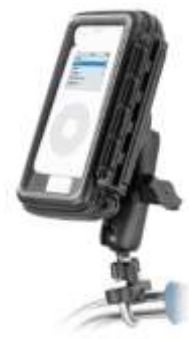
RAM-B-149Z-AQ2 RAM U-BOLT MOUNT MEDIUM SIZE AQUA BOX