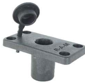
RAM-114FM RAM ROD 2000 FLUSH MOUNT BASE