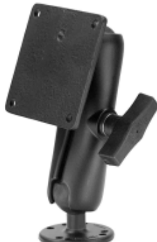
RAM-101U-2461 RAM MOUNT WITH VESA PLATE 75 MM