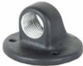
RAM-232-0 RAM 2.5 DIAMETER BASE WITH 1/2" NPT HOLE 0 DEGREE