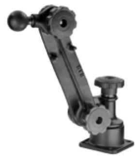
RAM-162H-MC4 RAM RATCHET SWING ARM WITH 1 1/2" BALL