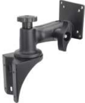
RAM-D-162V-MC2 RAM MC MASTER CARR SWING ARM VERTICAL BASE