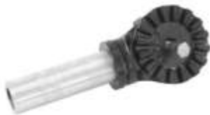
RAM-D-162PU RAM RATCHET FEATURE WITH 1" MALE POST