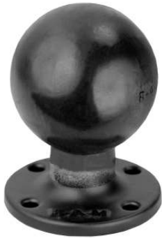
RAM-D-254BU RAM 2 7/16" DIAMETER BRASS BASE WITH BALL