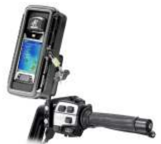
RAM-B-174-AQ1 RAM BRAKE/CLUTCH RESERVOIR LARGE SIZE AQUA BOX