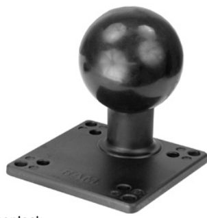
RAM-E-246U RAM 4.75 SQUARE VESA BASE 100 & 75 MIL.