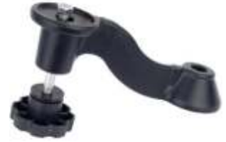
RAM-109-1A RAM SINGLE SWING ARM EXTENTION