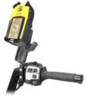
RAM-B-174-GA5 RAM BRAKE/CLUTCH RESERVOIR FOR THE GARMIN E-TREX