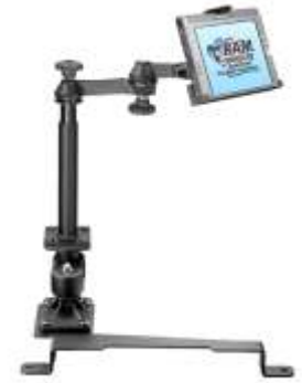
RAM-VB-163-MOT3 VEHICLE SYSTEM FOR THE 2005- NEWER HONDA PILOT