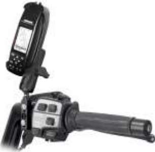
RAM-B-174-LO1 RAM BRAKE/CLUTCH RESERVOIR FOR THE LOWRANCE GLOBALMAP