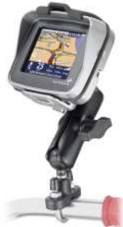
RAM-B-149Z-TO2 RAM RAIL MOUNT FOR THE TOMTOM RIDER