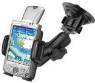
RAM-B-166-UN3 RAM UNIVERSAL SUCTION MOUNT FOR MEDIUM SIZE DEVICES