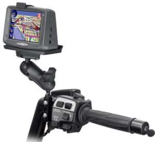
RAM-B-174-LO7 RAM BRAKE/CLUTCH RESERVOIR FOR THE LOWRANCE IWAY 350C