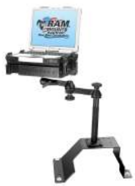
RAM-VB-107-SW1 VEHICLE SYSTEM FOR THE 1990-95 CAPRICE & 1991 CROWN VIC