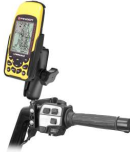
RAM-B-174-LO2 RAM BRAKE/CLUTCH RESERVOIR FOR THE LOWRANCE IFINDER