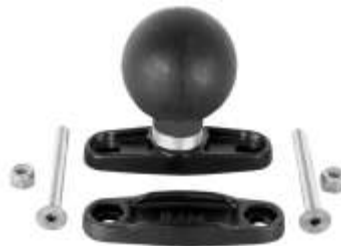
RAM-D-247U-2 RAM CLAMP BASE WITH BALL 2" MAXIMUM WIDTH