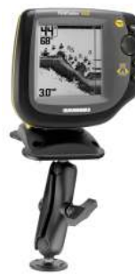
RAM-107 RAM MOUNT FOR THE HUMMINBIRD & APELCO 97