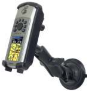
RAM-B-166-GA14 RAM SUCTION MOUNT FOR THE GARMIN 76C