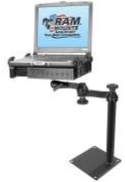
RAM-VBD-125-SW1 VEHICLE SYSTEM CHEVY PICKUP