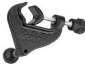
RAM-B-121BAU RAM CLAMP YOKE MOUNTING 1/4"-20