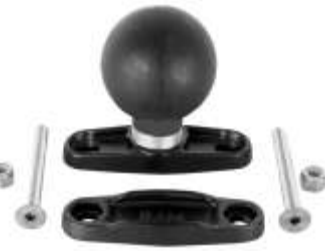
RAM-D-162V-MC3 RAM VERT. SWING ARM SYSTEM WITHOUT BALL BASE