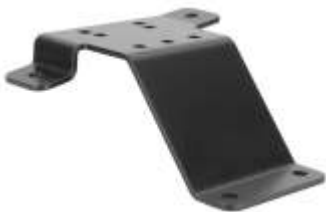
RAM-VBD-126 RAM DRILL TYPE SPECIFIC TRANS HUMP BASE