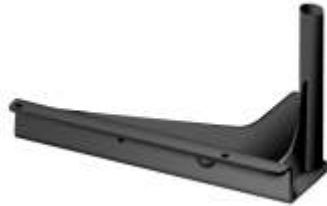
RAM-VB-164 VEHICLE BASE 2005-NEWER SEARS SEATING