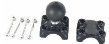
RAM-219 RAM 1 1/4" OD RAIL MOUNT ADAPTER WITH BALL