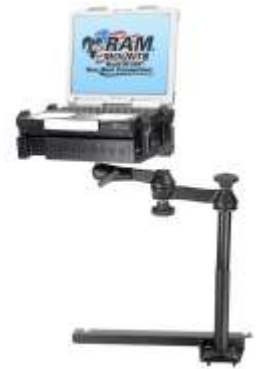
RAM-VB-150 VEHICLE BASE FOR THE 2005-NEWER SCION XB