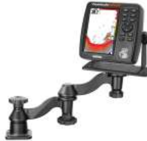
RAM-109H-1 RAM DOUBLE SWING ARM MOUNT SYSTEM HORIZONTAL BASE