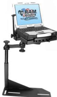
RAM-VB-117-PAN1 VEHICLE SYSTEM TOUGH DOCK