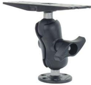
RAM-D-111U-C RAM MOUNT WITH 3" X 11" BASE SHORT ARM