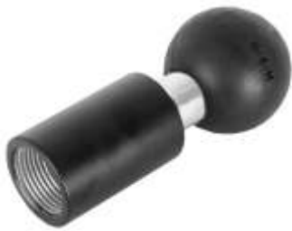
RAM-D-218-1 RAM SINGLE BALL WITH 1" NPT HOLE