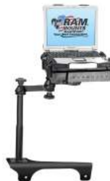
RAM-VB-165-SW1 VEHICLE SYSTEM FOR THE 2006- NEWER HUMMER H3