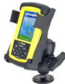
RAM-101U-B-TD1 RAM MOUNT WITH 2 2 1/2" BASES FOR THE TDS RECON