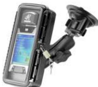
RAM-B-149Z-AQ1 RAM SUCTION MOUNT LARGE SIZE AQUA BOX