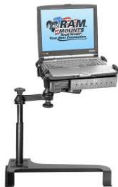
RAM-VB-150-SW1 VEHICLE SYSTEM FOR THE 2005- NEWER SCION XB