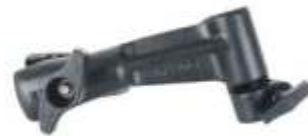
RAM-D-261U RAM SINGLE SWING ARM BALL SOCKET 1" PIPE