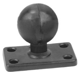
RAM-202U-152 RAM BASE 1.5" X 2" WITH 1 1/2" BALL