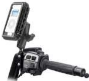
RAM-B-174-AQ2 RAM BRAKE/CLUTCH RESERVOIR MEDIUM SIZE AQUA BOX