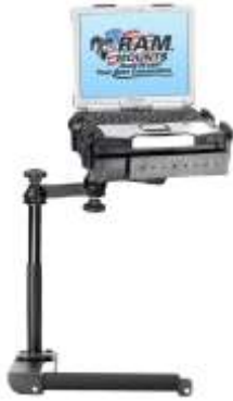
RAM-VB-149 VEHICLE BASE FOR THE 2005-NEWER TOYOTA HIGHLANDER