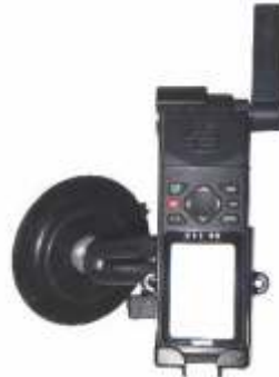
RAM-B-148-GA3 RAM SUCTION MOUNT FOR THE GARMIN 48,45,89,90