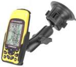
RAM-B-166-LO2 RAM SUCTION MOUNT FOR THE LOWRANCE IFINDER