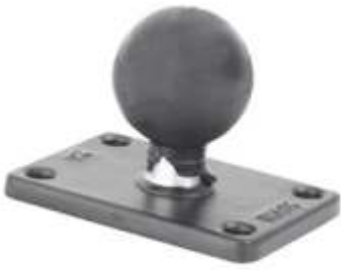
RAM-202U-25 RAM BASE 2" X 5" WITH 1 1/2" BALL