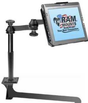
RAM-VB-154-MOT4 VEHICLE SYSTEM FOR THE 2004- NEWER NISSAN PATHINDER & XTERRA