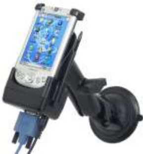
RAM-B-166-CO4P RAM SUCTION MOUNT POWERED DOCK FOR THE HP IPAQ 1900 & 4100