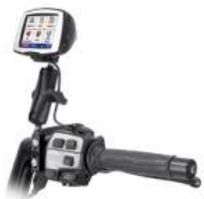
RAM-B-174-GA19 RAM BRAKE/CLUTCH RESERVOIR FOR THE GARMIN C320