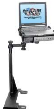
RAM-VB-119-SW1 VEHICLE SYSTEM FOR THE 1995- NEWER ECONOLINE VAN