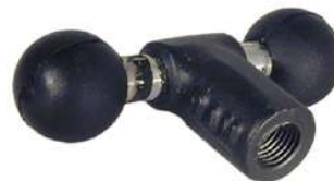
RAM-B-217-1 RAM DOUBLE BALL BASE WITH 1/4" NPT NO FLANGE