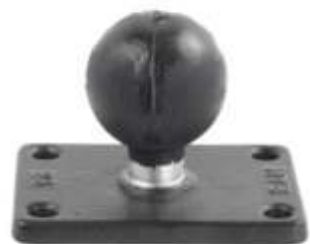
RAM-202U-23 RAM BASE 2" X 3" WITH 1 1/2" BALL