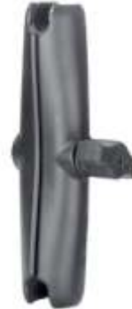
RAM-B-201-C RAM DOUBLE SOCKET ARM B BALL C LENGTH