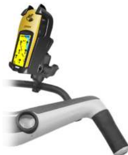
RAM-B-175-A-GA16U RAM ETREX COLOR WITH SEGWAY SHORT ARM