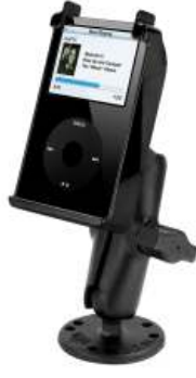
RAM-B-138-AP1 RAM MOUNT WITH 2 7/16" BASE FOR APPLE IPOD