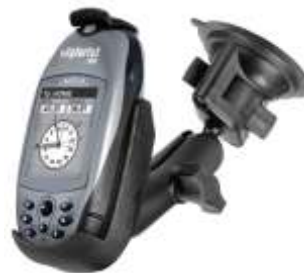
RAM-B-166-MA5 RAM SUCTION MOUNT FOR THE MAGELLAN EXPLORIST SERIES