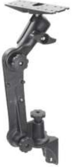
RAM-D-162V-MC1 RAM MC MASTER CARR SWING ARM VERTICAL SYSTEM