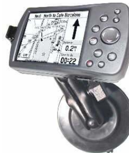
RAM-B-148-GA7 RAM SUCTION MOUNT FOR THE GARMIN 176, 276, 296