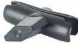
RAM-A-201 RAM DOUBLE SOCKET ARM