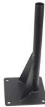
RAM-VBD-122 VEHICLE DRILL BASE UNIVERSAL SQUARE