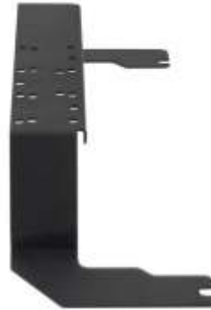
RAM-VB-103 VEHICLE BASE FOR THE 1500, 2500, 3500 SILVERADO