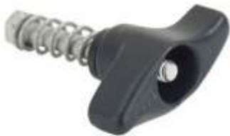
RAM-2-1M RAM METAL KNOB, BOLT, WASHERS & SPRING