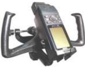
RAM-B-125-GA3 RAM YOKE MOUNT WITH CRADLE GARMIN 89, 90,92