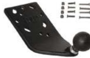
RAM-B-125B-G1U RAM FOR YOKES WITH MOUNTING HARDWARE