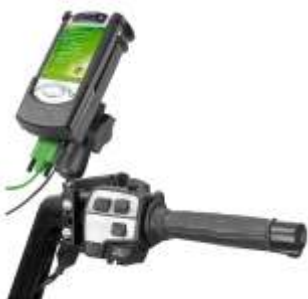
RAM-B-174-CO2P RAM BRAKE/CLUTCH RESERVOIR POWERED DOCK FOR HP IPAQ 3000 & 5000 SERIES