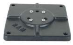
RAM-255U 6" X 6" BASE PLATE WITH 11 HOLES