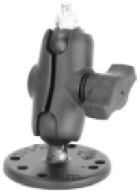
RAM-B-101-A-237U RAM MOUNT WITH 1 1/4"-20 BASE & 1 SHORT ARM