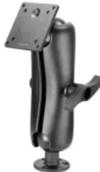
RAM-E-101U-246 RAM MOUNT VESA PLATE & 3.68 BASE WITH BALL