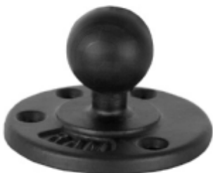
RAM-240 RAM 3.68 DIA BASE WITH BALL