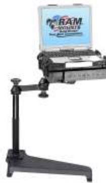
RAM-VB-137-SW1 VEHICLE SYSTEM FOR THE 2006- NEWER TOYOTA CAMRY