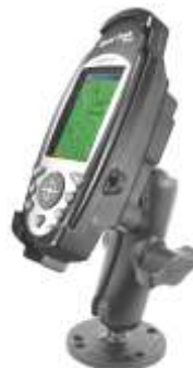
RAM-B-138-MA3 RAM MOUNT FOR THE MAGELLAN SPORTRAK