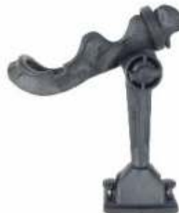
RAM-114-D RAM ROD 2000 ROD HOLDER WITH DECK, TRACK MOUNT