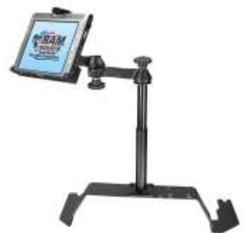
RAM-VB-103-MOT3 VEHICLE SYSTEM FOR THE 1500, 2500, 3500 SILVERADO