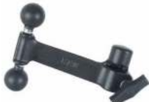
RAM-261-2U RAM 6" SWING ARM PEDESTAL DOUBLE BALL END