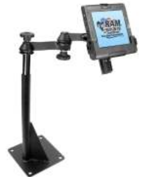
RAM-VBD-122-MOT1 VEHICLE SYSTEM UNIVERSAL SQUARE BASE