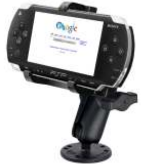
RAM-B-138-PD2 RAM MOUNT THREE FINDER PDA AND PORTABLE HOLDER