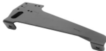
RAM-VB-139 VEHICLE BASE FOR THE 2004- NEWER HONDA ACCORD