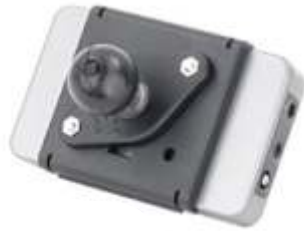
RAM-B-238-XM1U RAM BASE & BALL WITH MOUNTING HARDWARE