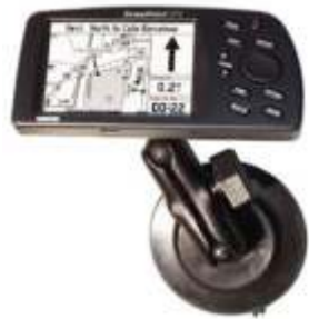
RAM-B-145S1 SUCTION BASE WITH 1" BALL FOR THE GARMIN STREETPILOT