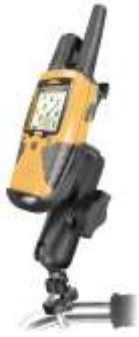
RAM-B-149Z-GA8 RAM MOUNT WITH U-BOLT FOR THE GARMIN RINO