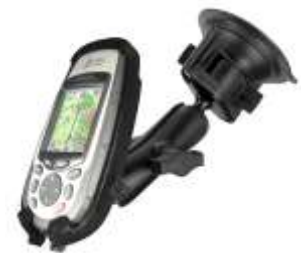
RAM-B-166-MA2 RAM SUCTION MOUNT FOR THE MAGELLAN MERIDIAN