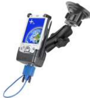
RAM-B-166-CO3P RAM SUCTION MOUNT POWERED DOCK FOR THE HP IPAQ 2000 SERIES