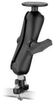
RAM-101U-IP1 RAM MOUNT WITH 202 & 231 BASE & ZINC U-BOLT