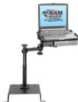
RAM-VB-115-SW1 VEHICLE SYSTEM FOR THE 1995-NEWER TAURUS