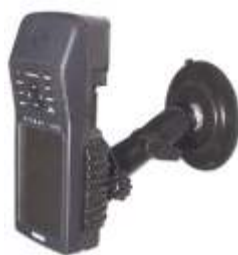
RAM-B-148-G1 RAM SUCTION CUP MOUNT WITH MOUNTING HARDWARE