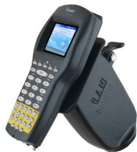
RAM-317U RAM UNIVERSAL SCANNER GUN HOLDER