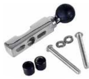
RAM-B-309-1CHU CHROME RAM CYCLE HANDLEBAR BASE WITH 1 BALL