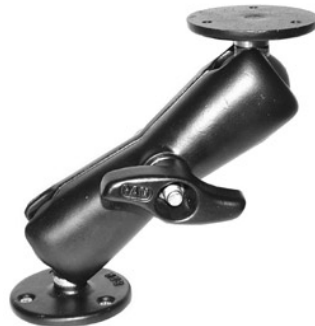
RAM-D-101U RAM MOUNT WITH 2-3.68 BASES WITH BALLS