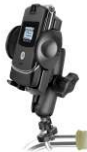
RAM-B-149Z-UN1 RAM UNIVERSAL RAIL MOUNT FOR SMALL SIZE DEVICES