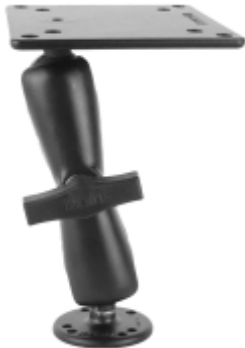
RAM-101U-246 RAM MOUNT WITH VESA PLATE 75 AND 100 MM