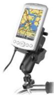
RAM-B-149Z-GA11 RAM RAIL MOUNT GARMIN ADAPTER