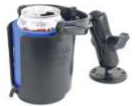
RAM-B-132U RAM DRINK CUP HOLDER MOUNT