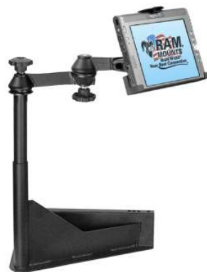
RAM-VB-140-MOT3 VEHICLE SYSTEM NATIONAL SEATING