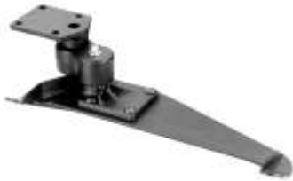
RAM-VB-138ST1 VEHICLE BASE FOR THE 2006- NEWER TOYOTA FJ CRUISER