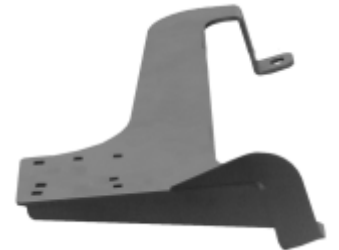
RAM-VB-151-MOT3 VEHICLE SYSTEM SEATS INC.