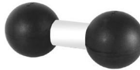
RAM-D-230U RAM DOUBLE 2 1/4" BALL ADAPTER