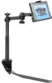
RAM-VB-144-MOT3 VEHICLE SYSTEM FOR THE 2006- NEWER KIA SORENTO