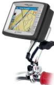
RAM-B-149CH-LO4 RAM U-BOLT MOUNT SHORT ARM, DIA BASE CHROME