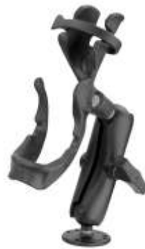
RAM-101-AT1U RAM MOUNT SYSTEM WITH 117B, 201-B & 215