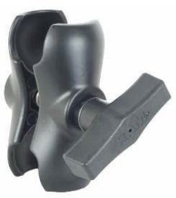
RAM-201-B RAM DOUBLE SOCKET ARM C BALL B LENGTH