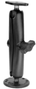
RAM-B-101U-C RAM MOUNT WITH 2 1/2" BASES & C ARM