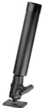
RAM-119-23U RAM TUBE FISHING ROD HOLDER WITH 2 X 3 BASE