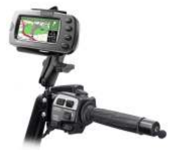
RAM-B-174-GA9 RAM BRAKE/CLUTCH RESERVOIR FOR THE GARMIN 2610