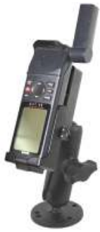
RAM-B-138-GA3 RAM MOUNT FOR GARMIN 48,45,89,90,92