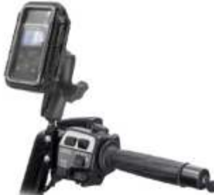
RAM-B-174-AQ3 RAM BRAKE/CLUTCH RESERVOIR SMALL SIZE AQUA BOX