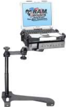
RAM-VB-135-SW1 VEHICLE SYSTEM FOR THE 2006- NEWER HONDA CRV