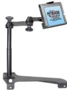
RAM-VB-135MH1-MOT3 VEHICLE SYSTEM FOR THE 2006- NEWER HONDA ELEMENT