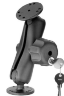
RAM-101U-BL RAM MOUNT WITH 2 2 1/2" & B ARM