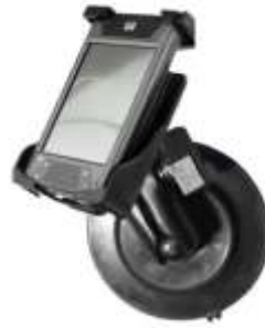
RAM-B-148-PD1 RAM SUCTION MOUNT WITH UNIVERSAL PDA CRADLE