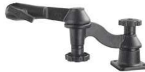
RAM-109H-G1U RAM DOUBLE SWING ARM WITH SINGLE SOCKET