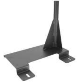
RAM-VB-120 VEHICLE BASE FOR THE 2004- NEWER FREESTAR