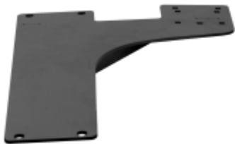
RAM-VB-157 VEHICLE BASE FOR THE 2006-NEWER