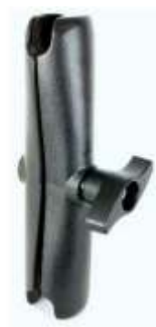
RAM-D-201U-E RAM D SIZE LONG LENGTH ARM