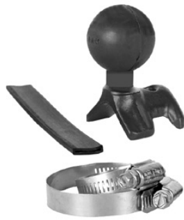
RAM-108B RAM BASE WITH BALL & STRAPS 1/2" TO 2" DIAMETER