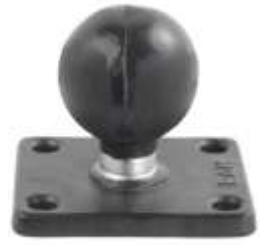
RAM-202U-22 RAM BASE 2" X 2" WITH 1 1/2" BALL