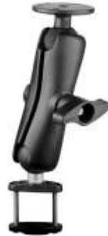
RAM-D-101U-HY2 RAM MOUNT WITH ROUND BASE & 2.5" PLATE