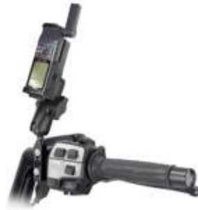
RAM-B-174-GA3 RAM BRAKE/CLUTCH RESERVOIR FOR THE GARMIN 48, 45, 89 & 90