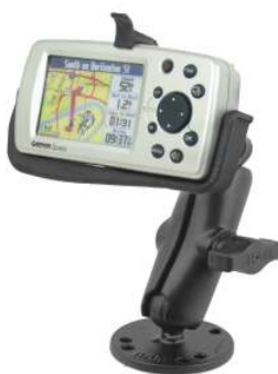
RAM-B-138-GA15 RAM MOUNT FOR GARMIN QUEST SERIES