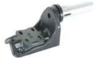
RAM-D-304B-HP RAM HORIZONTAL BASE WITH POST