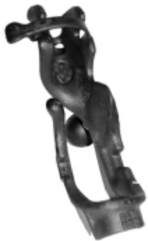
RAM-117B RAM-ROD FISHING ROD HOLDER