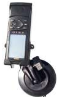
RAM-B-148-GA1 RAM SUCTION MOUNT FOR THE GARMIN GPS 12 SERIES