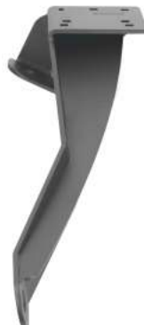
RAM-VB-142 VEHICLE BASE FOR THE 2005- NEWER GRAND CHEROKEE