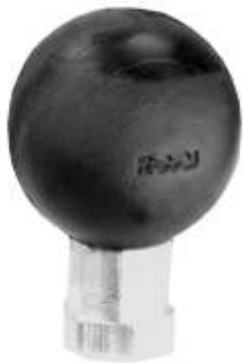
RAM-B-260U RAM 1" BALL WITH #10-24 THREADED HOLE