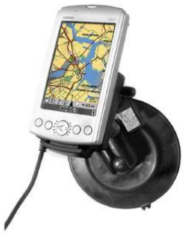
RAM-B-148-GA11 RAM SUCTION MOUNT GARMIN ADAPTER