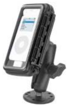
RAM-B-138-AQ2 RAM MOUNT WITH 2 7/16" BASE FOR AQUA BOX MEDIUM