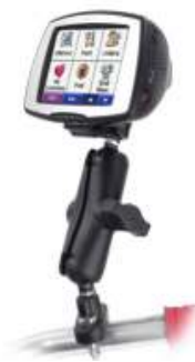
RAM-B-149Z-GA19U RAM U-BOLT FOR THE GARMIN C320, C330 & C340