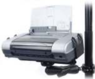
RAM-VPR-103-1 VEHICLE PRINTER SYSTEM FOR THE HP-450