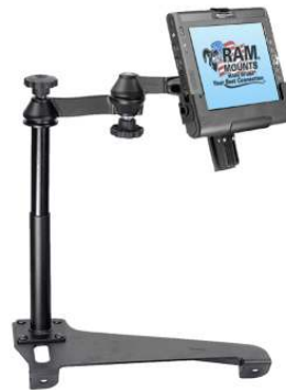
RAM-VB-139-MOT1 VEHICLE SYSTEM FOR THE 2004- NEWER HONDA ACCORD