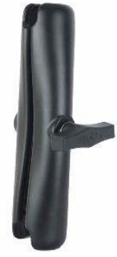
RAM-201U-D RAM DOUBLE SOCKET ARM C BALL D LENGTH