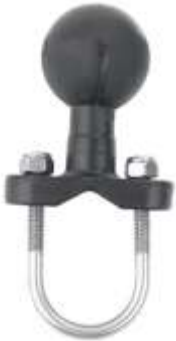
RAM-231-1U RAM 1 1/4" RAIL MOUNT