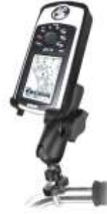
RAM-B149Z-GA6 RAM U-BOLT MOUNT FOR THE GARMIN GPS 76 SERIES