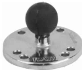
RAM-B-202CHU CHROME RAM 2 1/2" DIAMETER BASE WITH BALL