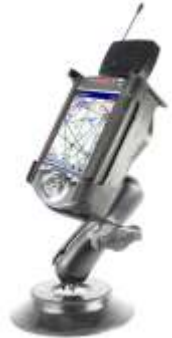
RAM-B-148-CO1 HP IPAQ HOLDER WITH SUCTION CUP