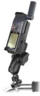
RAM-B-149Z-GA3 RAM U-BOLT MOUNT FOR THE GARMIN 48,45,89 & 90