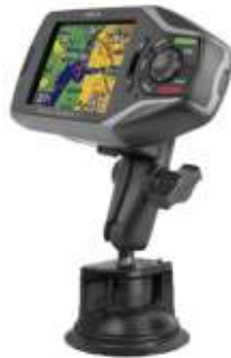
RAM-B-166-MA4 RAM SUCTION MOUNT FOR THE MAGELLAN ROADMATE