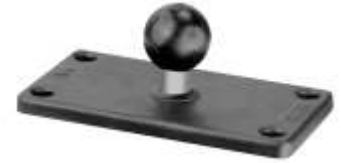
RAM-B-202U-24 RAM BASE 2" X 4" WITH 1" BALL