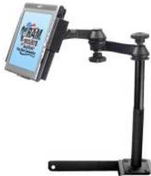
RAM-VB-105-MOT2 VEHICLE SYSTEM FOR THE 1997-NEWER DAKOTA & DURANGO