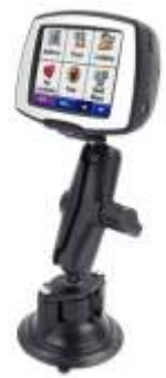
RAM-B-166-GA19U RAM SUCTION MOUNT FOR THE GARMIN C320