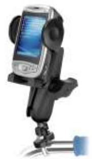
RAM-B-149Z-UN2 RAM UNIVERSAL RAIL MOUNT FOR MEDIUM SIZE DEVICES