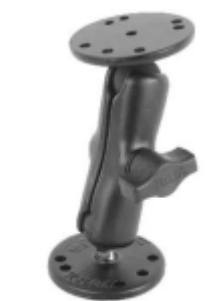
RAM-B-101-G1 RAM MOUNT WITH MOUNTING HARDWARE