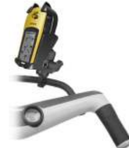
RAM-B-175-A-GA5U RAM ETREX B/W WITH SEGWAY SHORT ARM