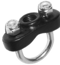
RAM-B-241U RAM SINGLE U-BOLT BASE WITH 1/4" NPT HOLE