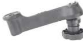
RAM-109-1ATPU RAM SNGLE SWING ARM NO BEND