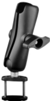
RAM-D-101U-HY1 RAM MOUNT WITH 2" RAIL & 2.5" PLATE