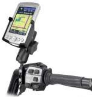
RAM-B-174-GA10 RAM BRAKE/CLUTCH RESERVOIR FOR THE GARMIN IQE