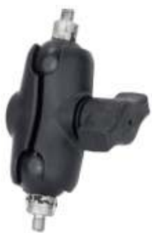
RAM-B-323-AU RAM MOUNT WITH 2 1/4"-20 BASES