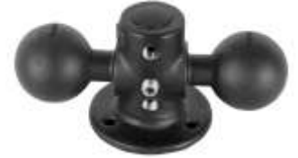
RAM-217-1U RAM DOUBLE BALL WITH 2.5" BS & 5/8" HOLE