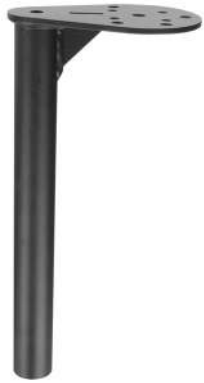
RAM-VP-TTMF12U RAM TELE-POLE BASE MALE WITH FLANGE 12" LONG