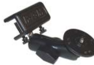
RAM-B-127 RAM WINDOW SCOPE & CAMERA MOUNT