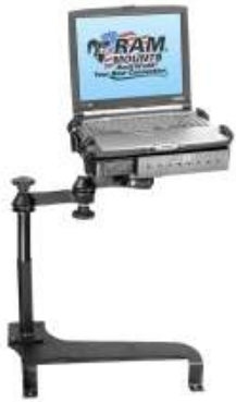
RAM-VB-132-SW1 VEHICLE SYSTEM FOR THE 2006- NEWER HONDA RIDGELINE