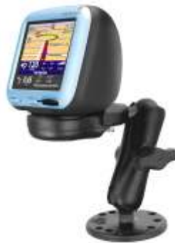
RAM-B-138-TO1 RAM MOUNT FOR THE TOMTOM GO SERIES