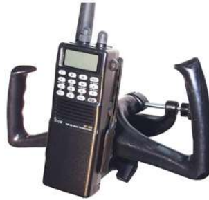
RAM-B-125-BC1 RAM YOKE MOUNT WITH CRADLE FOR BELT CLIPS