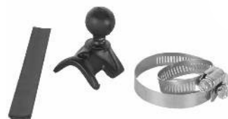
RAM-B-108B RAM V BASE BALL & STRAPS FOR 1/2"-2" DIA