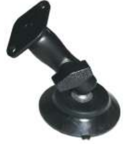
RAM-B-148 RAM SUCTION MOUNT. WITH 2.43 DIAMETER & 2.43 X 1.3 BASES