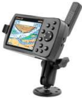
RAM-B-138-GA7 RAM MOUNT FOR GARMIN GPS 176