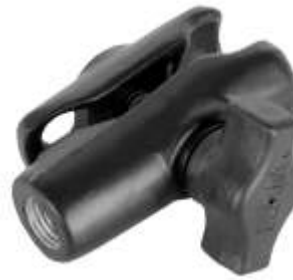
RAM-B-200-1 RAM SINGLE BALL SOCKET ARM FOR 1" BALLS