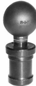
RAM-218U RAM BALL WITH 1 1/8" POST FOR PHOTO