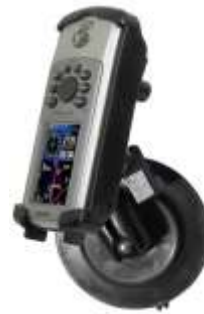
RAM-B-148-GA14 RAM SUCTION FOR THE GARMIN GPS 76CS