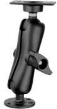
RAM-D-101U-GAM1 RAM MOUNT. D-243, D-201, D-254