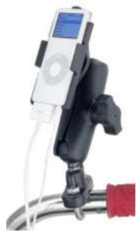
RAM-B-149Z-AP2 RAM U-BOLT MOUNT FOR THE IPOD NANO