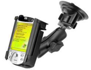
RAM-B-166-CO2 RAM SUCTION MOUNT FOR THE HP IPAQ 3000 & 5000 SERIES