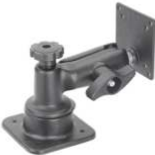
RAM-D-162H-MC2 RAM MC MASTER CARR SWING ARM HORIZONTAL BASE