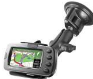
RAM-B-166-GA9 RAM SUCTION MOUNT FOR THE GARMIN 2610