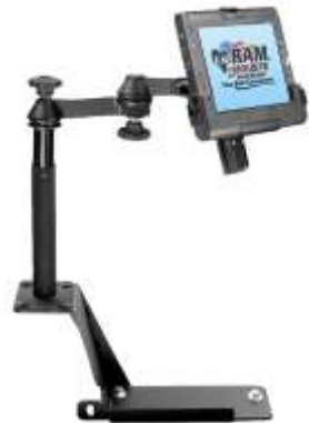
RAM-VB-112-MOT1 VEHICLE SYSTEM FOR THE 2002-NEWER EXPLORER