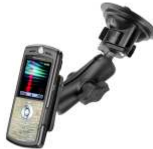
RAM-B-166-300 RAM SUCTION MOUNT WITH POWER PLATE