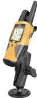
RAM-B-138-GA8 RAM MOUNT FOR GARMIN RINO SERIES