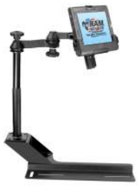
RAM-VB-106R4-MOT1 VEHICLE SYSTEM FOR THE DODGE SPRINTER VAN