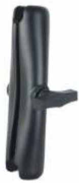
RAM-201-D RAM DOUBLE SOCKET ARM C BALL D LENGTH