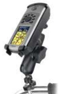
RAM-B-149Z-GA14 RAM U-BOLT FOR THE GARMIN GPS 76CS