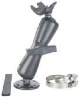
RAM-108 RAM TROLLING MOTOR STABILIZER