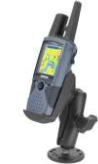
RAM-B-138-GA20 RAM MOUNT FOR GARMIN RINO 520 AND 530