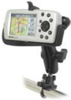
RAM-B-149Z-GA15U RAM U-BOLT FOR THE GARMIN QUEST