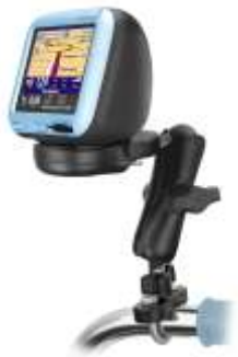
RAM-B-149Z-TO1U RAM U-BOLT MOUNT FOR THE TOMTOM GO