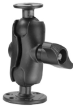
RAM-D-101-C-254U RAM MOUNT WITH 3.68 BASE & 2.5 BASE