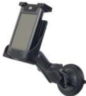
RAM-B-166-PD1 RAM SUCTION MOUNT WITH UNIVERSAL PDA CRADLE