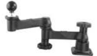
RAM-109H-1BU RAM DOUBLE SWING ARM WITH 1 1/2" BALL