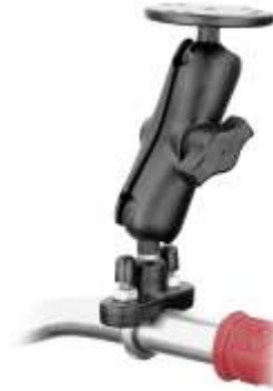
RAM-B-101U-IP RAM MOUNT WITH B-202 & 231 BASE AND ZINC U-BOLT