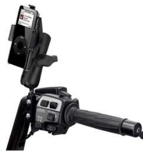
RAM-B-174-AP2 RAM BRAKE/CLUTCH RESERVOIR FOR THE APPLE IPOD NANO