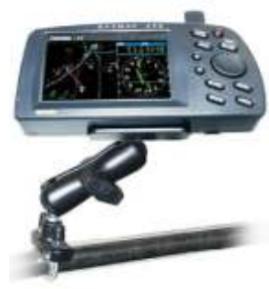
RAM-B-149Z-G1 RAM MOUNT WITH U-BOLT BASE & MOUNTING HARDWARE