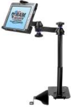
RAM-VB-141-MOT3 VEHICLE SYSTEM FOR THE 2003- NEWER JEEP LIBERTY