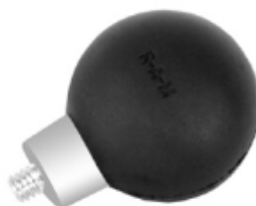
RAM-237 RAM BALL WITH 1/4"-20 THREADED STUD