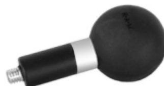
RAM-239 RAM BALL WITH 5/16"-18 POST (NET SAFETY)