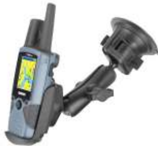
RAM-B-166-GA20 RAM SUCTION MOUNT FOR THE GARMIN RINO 520 & 530