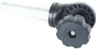
RAM-D-285U RAM 1" MALE PIPE WITH F TEETH ADJUSTABLE DESIGN