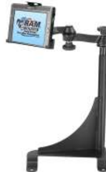
RAM-VB-136-MOT3 VEHICLE SYSTEM FOR THE 2005- NEWER ASTRO VAN