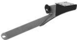
RAM-VB-144 VEHICLE BASE FOR THE 2006-NEWER KIA SORENTO