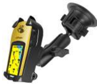
RAM-B-149Z-GA16 RAM SUCTION MOUNT FOR THE GARMIN ETREX COLOR