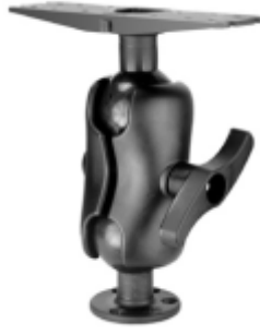
RAM-E-111U-D RAM MOUNT WITH 3" X 11" BASE & SHORT ARMS