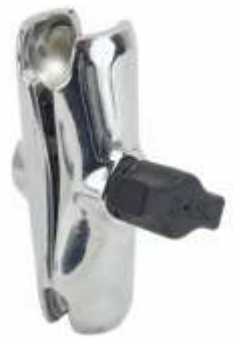
RAM-B-201CHU CHROME RAM DOUBLE SOCKET ARM FOR 1" BALL