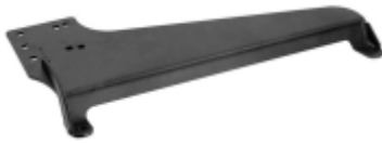
RAM-VB-150-MOT4 VEHICLE SYSTEM FOR THE 2005- NEWER SCION XB