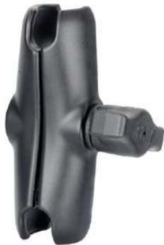
RAM-B-201U-125 125 BULK PACKAGED DOUBLE SOCKET ARMS FOR 1" BALL