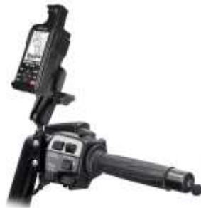
RAM-B-174-MA1 RAM BRAKE/CLUTCH RESERVOIR FOR THE MAGELLAN 12, 300 & 315