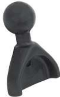
RAM-B-202U-TO1 RAM TOMTOM GO BASE