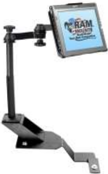
RAM-VB-102-MOT4 VEHICLE SYSTEM FOR THE 2000-NEWER 2500 & 3500 SUBURBAN