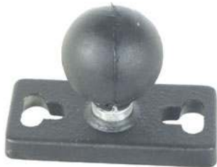
RAM-151BU RAM BOSCH BASE WITH 1 1/2" DIAMETER BALL