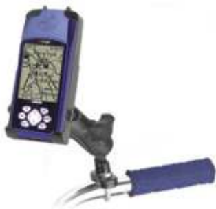
RAM-B-149Z-GA4 RAM U-BOLT MOUNT FOR THE GARMIN E-MAP