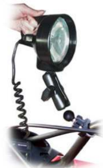
RAM-B-152R RAM SPOTLIGHT WITH MOUNT & U-BOLT BASE