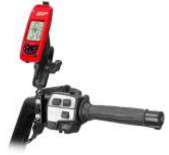
RAM-B-174-LO5 RAM BRAKE/CLUTCH RESERVOIR FOR THE LOWRANCE IFINDER GO