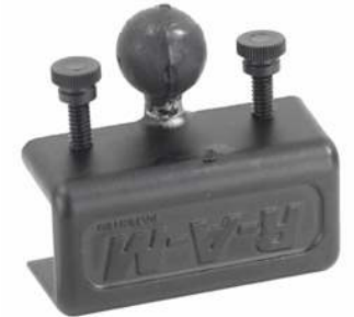
RAM-B-259U RAM 1" X 1" U-CHANNEL CLAMP WITH 1" BALL