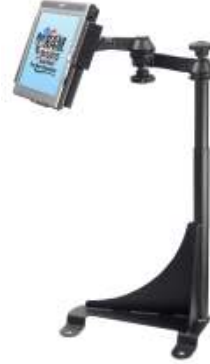
RAM-VB-143-MOT2 VEHICLE SYSTEM FOR THE 200 NEWER- EXPRESS SAVANA VAN