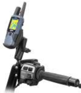
RAM-B-174-GA20 RAM BRAKE/CLUTCH RESERVOIR FOR THE GARMIN RINO 520 & 530