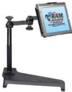
RAM-VB-137-MOT4 VEHICLE SYSTEM FOR THE 2006- NEWER TOYOTA CAMRY