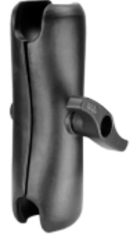
RAM-E-201U RAM DOUBLE SOCKET ARM E BALLS