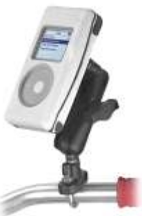
RAM-B-149Z-OT1 RAM U-BOLT MOUNT FOR THE OTTERBOX