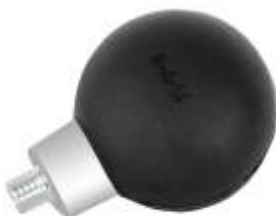
RAM-236 RAM SPOTLIGHT BASE WITH 3/8-16 THIRD POST