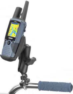
RAM-B-149Z-GA20U RAM U-BOLT FOR THE GARMIN RINO 530 & 520