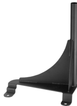
RAM-VB-136 VEHICLE BASE FOR THE 2005- NEWER ASTRO VAN