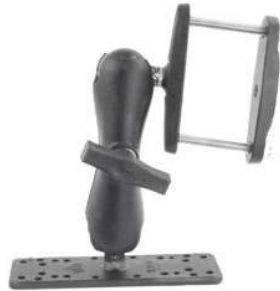
RAM-111-247U-3 RAM MOUNT 111B, 3" SQUARE TUBE BASE