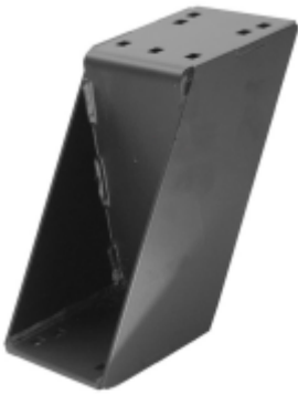
RAM-VB-SB7 RAM 7" VEHICLE BASE RISER