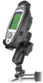
RAM-B-149Z-MA3 RAM U-BOLT MOUNT FOR THE MAGELLAN SPORTRAK