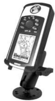
RAM-B-138-GA6 RAM MOUNT FOR GARMIN GPS 76 SERIES