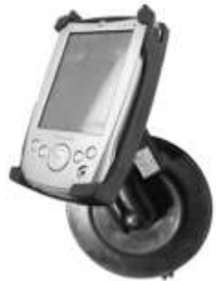
RAM-B-148-DE1 RAM SUCTION MOUNT FOR THE DELL AXIM 5