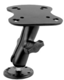
RAM-B-107 RAM MOUNT HUMMINBIRD & APELCO 1" BALL