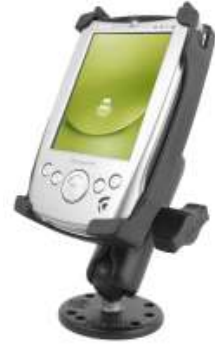
RAM-B-138-DE1 RAM MOUNT FOR DELL AXIM 5