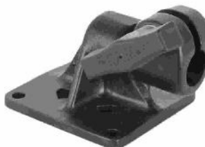
RAM-2461HU RAM SMALL 75 MM VESA PLATE WITH 1/2" HOLE