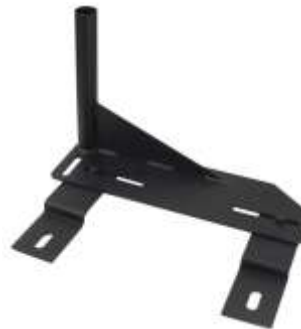
RAM-VB-121 VEHICLE BASE FOR THE 1996- NEWER CARAVAN