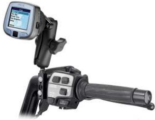
RAM-B-174-GA22 RAM BRAKE/CLUTCH RESERVOIR FOR THE GARMIN STREETPILOT I SERIES