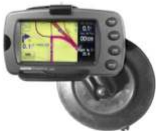
RAM-B-148-GA9 RAM SUCTION MOUNT FOR THE GARMIN 2610