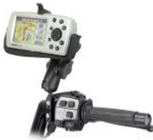
RAM-B-174-GA15 RAM BRAKE/CLUTCH RESERVOIR FOR THE GARMIN QUEST