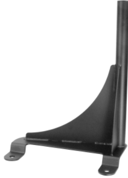
RAM-VB-143 VEHICLE BASE FOR THE 200 NEWER- EXPRESS SAVANA VAN