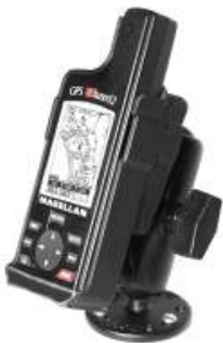
RAM-B-138-MA1 RAM MOUNT FOR THE MAGELLAN 12,300,315,320