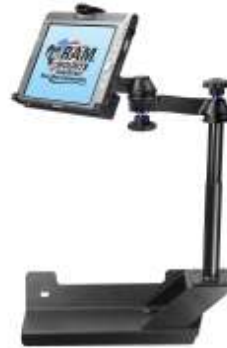
RAM-VB-104-MOT3 VEHICLE SYSTEM FOR THE RAM 1500 & RAM 2500/3500