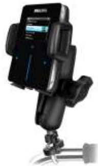
RAM-B-149Z-UN3 RAM UNIVERSAL RAIL MOUNT FOR MEDIUM SIZE DEVICES