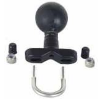
RAM-231 RAM BASE WITH U-BOLT FOR 3/4" TO 1" DIAMETER