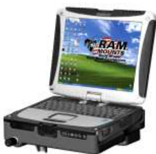
RAM-234-PAN2P RAM PANASONIC LAPTOP MOUNT CF-18 TOUGH TRAY PLASTIC