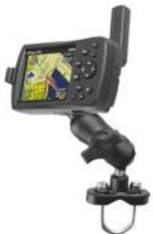
RAM-B149ZA-GA7U RAM U-BOLT MOUNT FOR THE GARMIN 176, 276, 296R