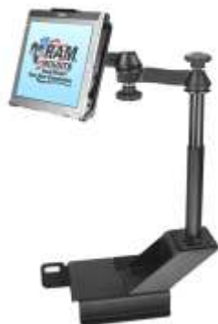
RAM-VB-113-MOT4 VEHICLE SYSTEM FOR THE 1994-NEWER RANGER