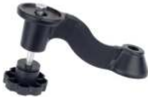
RAM-109-1APU RAM SINGLE SWING ARM FOR PEDESTAL SYSTEMS