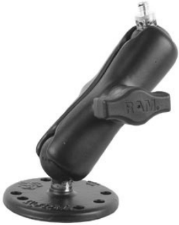
RAM-B-101-237U RAM MOUNT WITH 1 1/4"-20 BASE & 1 STUD