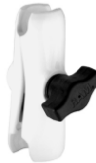
RAM-B-201WU WHITE RAM DOUBLE SOCKET ARM FOR 1" BALL