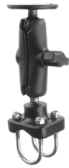
RAM-B-101-235U RAM MOUNT WITH DOUBLE U-BOLT BASE