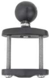
RAM-247U-2 RAM CLAMP BASE WITH BALL 2" MAX WIDTH