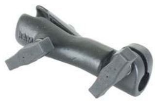
RAM-200-CHU RAM SINGLE SOCKET ARM WITH 1/2" FEMALE HOLE