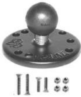
RAM-B-202-G3U RAM BASE & BALL WITH GARMIN MOUNTING HARDWARE