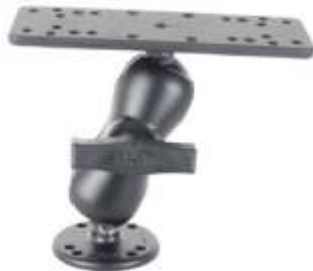
RAM-111U-B RAM MOUNT WITH 1.5" BALLS B LENGTH ARM