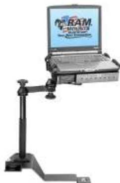
RAM-VB-114-SW1 VEHICLE SYSTEM FOR THE 2002-NEWER TRAIL BLAZER & ENVOY