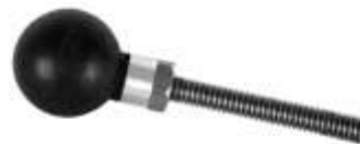
RAM-B-273U RAM BASE WITH 1/4"-20 HOLE HEX & 1" BALL