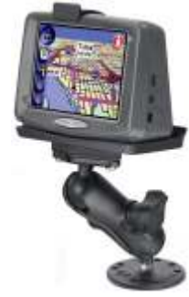
RAM-B-138-LO7 RAM MOUNT FOR THE LOWRANCE IWAY 350C