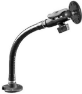
RAM-B-123-9012BU RAM 12" FLEX ARM 90 DEG. BASE SING ARM