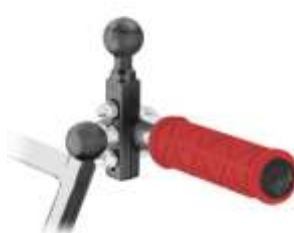
RAM-B-309-8U CLUTCH, BRAKE, UBOLT COMBO HANDLEBAR KIT