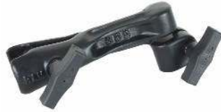
RAM-261U RAM SWING ARM WITH SINGLE SOCKET PEDESTAL