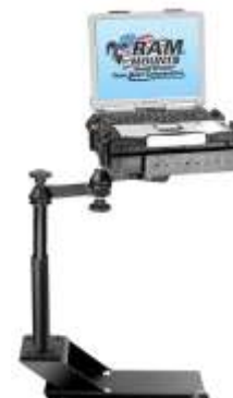
RAM-VB-116-SW1 VEHICLE SYSTEM FOR THE 2004-NEWER COLORADO