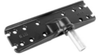
RAM-137BPU RAM 3" X 11" BASE WITH 1/2" POST