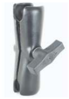
RAM-201 RAM DOUBLE BALL SOCKET ARM ASSEMBLY