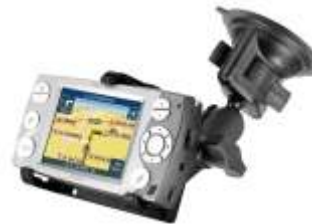
RAM-B-166-PD2 RAM SUCTION MOUNT THREE FINDER PDA HOLDER