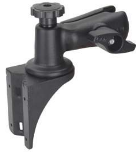
RAM-D-162V-MC3 RAM VERTICAL SWING ARM SYSTEM WITHOUT BALL BASE