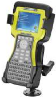
RAM-101U-TD2 RAM MOUNT FOR THE TDS RANGER