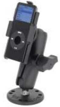
RAM-B-138-AP2 RAM MOUNT WITH 2 7/16" BASE FOR APPLE IPOD NANO