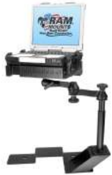
RAM-VB-109-SW1 VEHICLE SYSTEM FOR THE 2004-NEWER F150