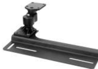
RAM-VB-146 VEHICLE BASE FOR THE 2006-NEWER DODGE CARAVAN