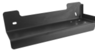
RAM-VB-104 VEHICLE BASE FOR THE RAM 1500 & RAM 2500/3500