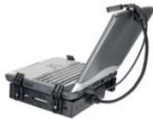
RAM-234-LU RAM USB COMPUTER LIGHT