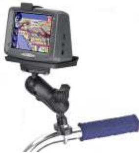
RAM-B-149Z-LO7 RAM RAIL MOUNT FOR THE LOWRANCE IWAY 350C