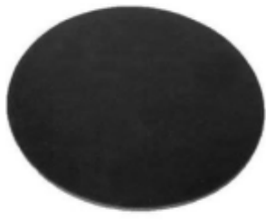
RAM-202PSA 2 7/16" DIAMETER DOUBLE ADHESIVE MOUNTING PAD