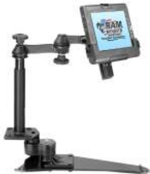
RAM-VB-138ST1-MOT1 VEHICLE SYSTEM FOR THE 2006- NEWER TOYOTA FJ CRUISER