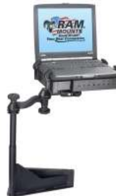
RAM-VB-140-SW1 VEHICLE SYSTEM NATIONAL SEATING