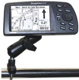
RAM-B-145R RAM U-BOLT BASE WITH 1" BALL FOR THE GARMIN STREETPILOT