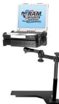
RAM-VB-157-SW1 VEHICLE SYSTEM FOR THE 2006-NEWER CHEVY MALIBU