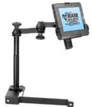
RAM-VB-155-MOT1 VEHICLE SYSTEM FOR THE 2006- NEWER HONDA CIVIC