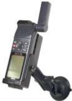
RAM-B-166-GA3 RAM SUCTION MOUNT FOR THE GARMIN 48, 45, 89 & 90