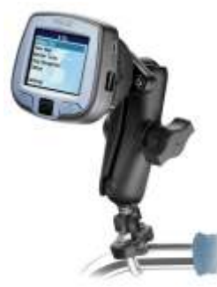
RAM-B-149Z-GA22 RAM U-BOLT FOR THE GARMIN STREETPILOT I SERIES