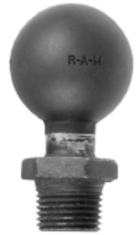
RAM-207U RAM BALL WITH 1/2" NPT MALE