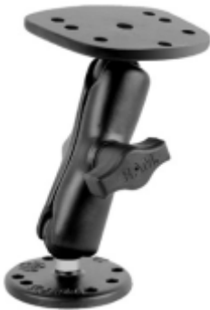
RAM-B-107-1U RAM FOR HUMMINBIRD PIRANHA