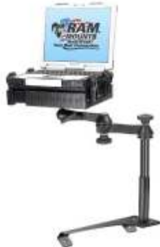
RAM-VB-166-SW1 VEHICLE SYSTEM FOR THE 2006- NEWER FORD EXPEDITION