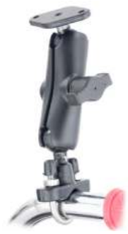
RAM-B-149Z RAM U-BOLT MOUNT WITH 2.43 DIAMETER & 2.43 X 1.31