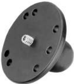
RAM-B-202A RAM 2 1/2" DIAMETER BASE WITH 1/4" 20 STST STUD