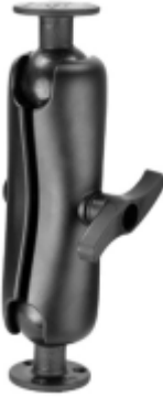
RAM-E-101U RAM MOUNT WITH 2-3.68 BASES WITH BALLS