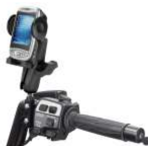
RAM-B-174-UN2 RAM BRAKE/CLUTCH RESERVOIR FOR MEDIUM SIZE DEVICES