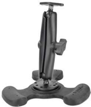
RAM-B-101-AW1U RAM SYSTEM WITH WEIGHTED BASE LONG ARM