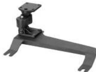
RAM-VB-159 VEHICLE BASE FOR THE 2007 CHEVY TAHOE