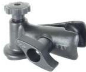
RAM-D-162SAU RAM SWIVEL BASE WITH SINGLE SOCKET ARM