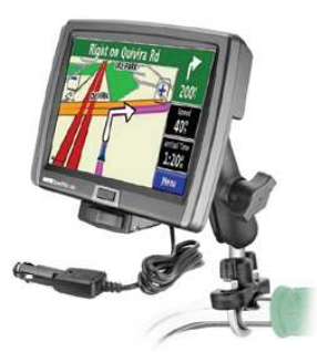
RAM-B-149Z-G3U RAM MOUNT WITH U-BOLT FOR THE GARMIN 7200