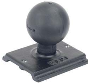
RAM-D-228U TRACK PLATE WITH POST FOR TITE-LOK