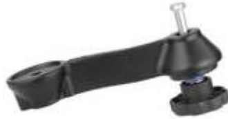
RAM-109-1ASU RAM SINGLE SWING ARM STRAIT EXTENTION