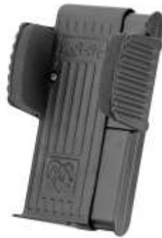
RAM-B-120B RAM QUICK RELEASE HOLDER ONLY WITH 1" BALL