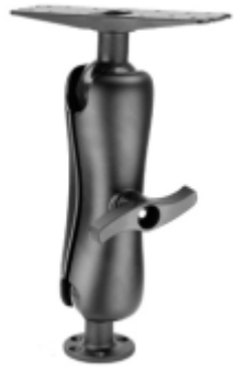
RAM-E-111U RAM MOUNT WITH 3" X 11" BASE & 3 3/4" BASE