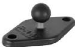
RAM-A-238 A Size Ball 0.56" Diameter