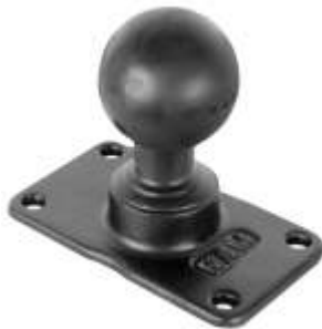
RAM-D-243U 2 13/16" X 5" PLATE WITH BALL