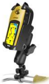
RAM-B-149Z-GA16U RAM U-BOLT FOR THE GARMIN ETREX COLOR