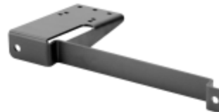
RAM-VB-155 VEHICLE BASE FOR THE 2006- NEWER HONDA CIVIC