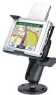
RAM-B-138-GA21 RAM MOUNT FOR GARMIN NUVI