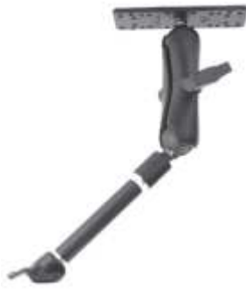
RAM-134-45 RAM 45 DEGREE BASE 6" PIPE DOUBLE SOCKET MOUNT