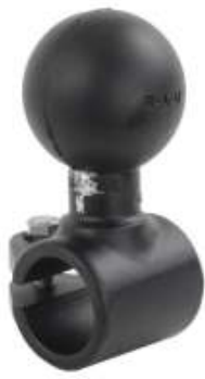
RAM-D-313-CU 1/2" RAIL BASE WITH 2 1/4" DIAMETER BALL