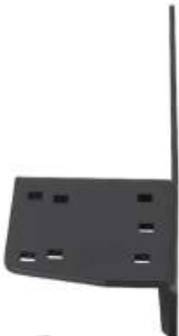
RAM-VB-105 VEHICLE BASE FOR THE 1997-NEWER DAKOTA & DURANGO