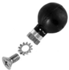
RAM-B-309-3U RAM CYCLE HANDLEBAR BALL