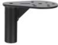
RAM-VP-TTMF4U RAM TELE-POLE BASE MALE WITH FLANGE 4" LONG