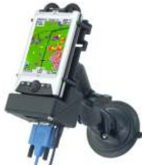
RAM-B-166-CO5P RAM SUCTION MOUNT POWERED IPAQ FAMILY