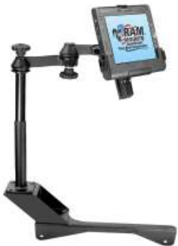
RAM-VB-145-MOT1 VEHICLE SYSTEM CHRYSLER 300 2006- NEWER