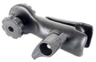
RAM-162BAU RAM RATCHET BASE WITH SINGLE SOCKET ARM