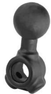
RAM-B-309-5U RAM 1/2" ID RAIL BASE WITH 1" BALL