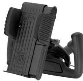
RAM-B-120-YK1 RAM HAND HELD HOLDER WITH YOKE C-CLAMP