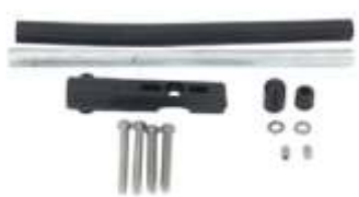
RAM-B-318-1U RAM CYCLE BASE WITH 9" FLEX ROD