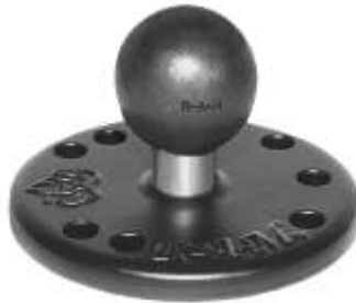
RAM-B-202 B Size Ball 1" Diameter