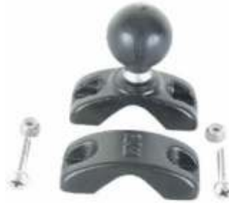
RAM-271U-12 RAM 1 1/4"-1 7/8" DIAMETER RAIL BASE WITH BALL