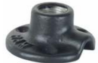
RAM-232-90 RAM 2 1/2" DIAMETER BASE WITH 1/2" NPT HOLE 90 DEGREE