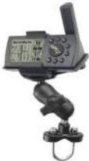
RAM-B-149ZA-GA2 RAM U-BOLT MOUNT WITH A ARM FOR THE GARMIN II & III