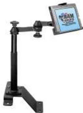
RAM-VBD-126-MOT3 RAM DRILL TYPE SPECIFIC TRANS HUMP SYSTEM