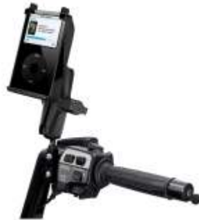
RAM-B-174-AP1 RAM BRAKE/CLUTCH FOR THE RESERVOIR APPLE IPOD