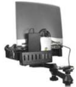
RAM-234-5U RAM POWER CADDY