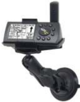
RAM-B-166-GA2 RAM SUCTION MOUNT FOR THE GARMIN 2, 3 & 5