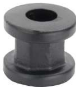
RAM-D-280U RAM DOUBLE THICK OCTAGON BUTTON