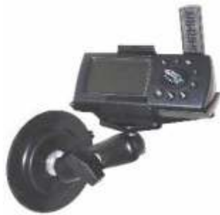
RAM-B-148-GA2 RAM SUCTION MOUNT FOR THE GARMIN GPS II & II