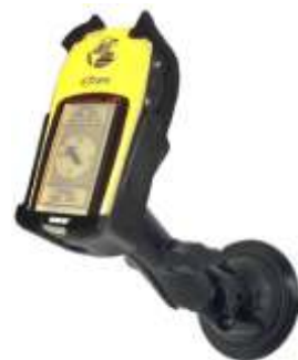
RAM-B-166-GA5 RAM SUCTION MOUNT FOR THE GARMIN E-TREX