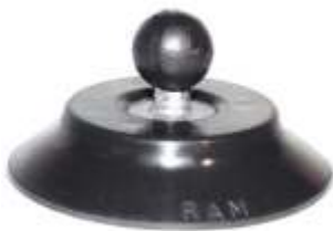
RAM-B-224 RAM 1" BALL WITH 4" SUCTION CUP BASE