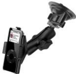
RAM-B-166-AP2 RAM SUCTION MOUNT FOR THE APPLE IPOD NANO