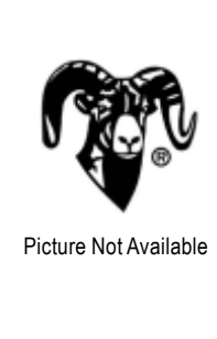
RAM-101U-VE4 VARIABLE BASE WITH PEDESTAL AND TRAY