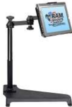
RAM-VB-150-SW1 VEHICLE SYSTEM FOR THE 2005- NEWER SCION XB