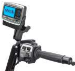
RAM-B-174-XM1 RAM BRAKE/CLUTCH RESERVOIR FOR XM SATELLITE RADIOS