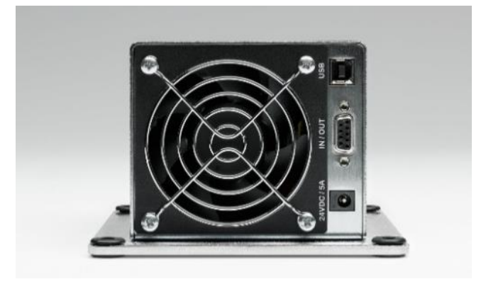
A 20990 Rear view