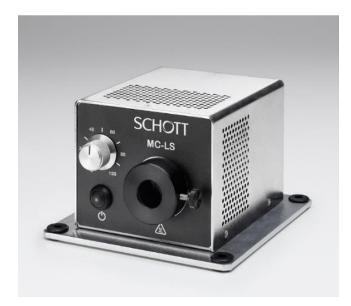
MC-LS Light Source, A20990

As the standard LED fiber optic light source in the SCHOTT ColdVision range, the MC-LS delivers exceptional light output from its high-brightness LED engine. Developed for stereo microscopy, the design of the light source makes it highly suitable for desktop usage, where its USB port can easily connect to application software systems