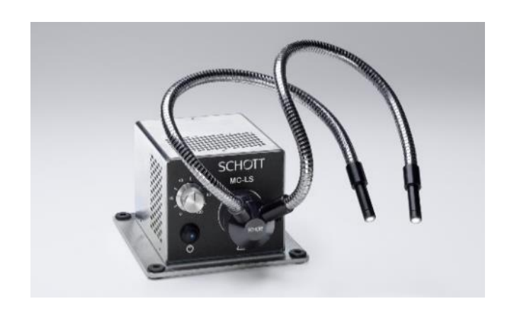
A20990 with gooseneck attachment