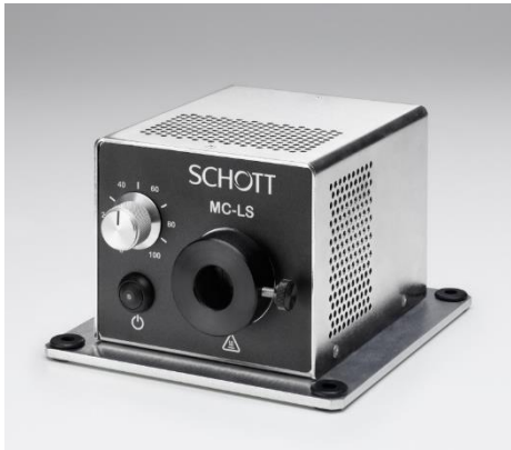
MC-LS Light Source, A20990

As the standard LED fiber optic light source in the SCHOTT ColdVision range, the MC-LS delivers exceptional light output from its high-brightness LED engine. Developed for stereo microscopy, the design of the light source makes it highly suitable for desktop usage, where its USB port can easily connect to application software systems