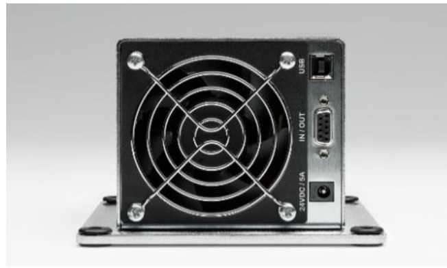
A 20990 Rear view