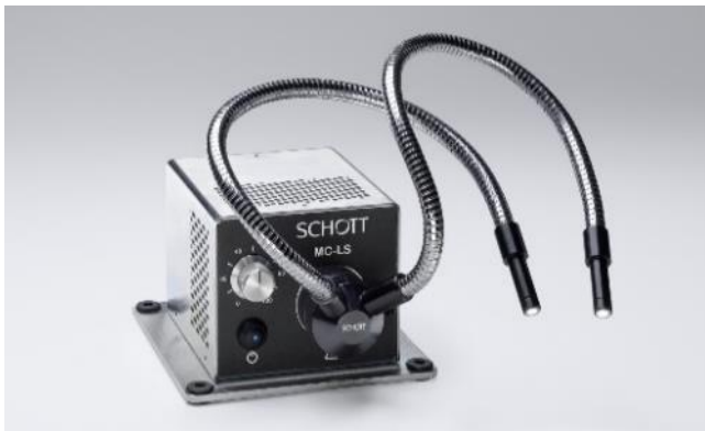
A20990 with gooseneck attachment